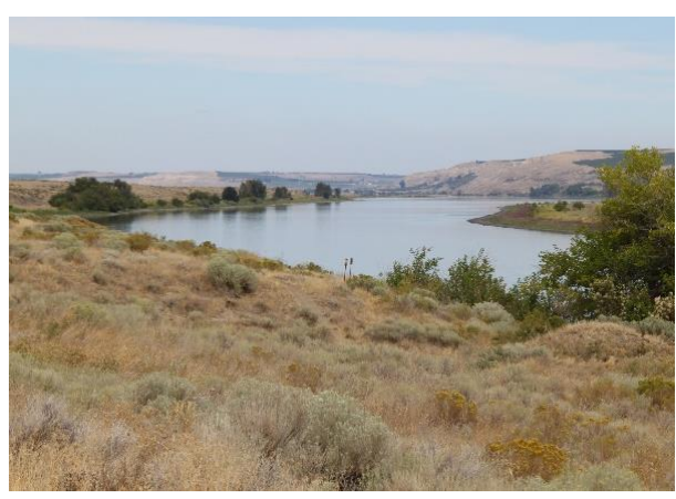
The Soil and Groundwater Remediation Project completed uranium sequestration efforts in the 300 Area. Monitoring and sampling is now underway.