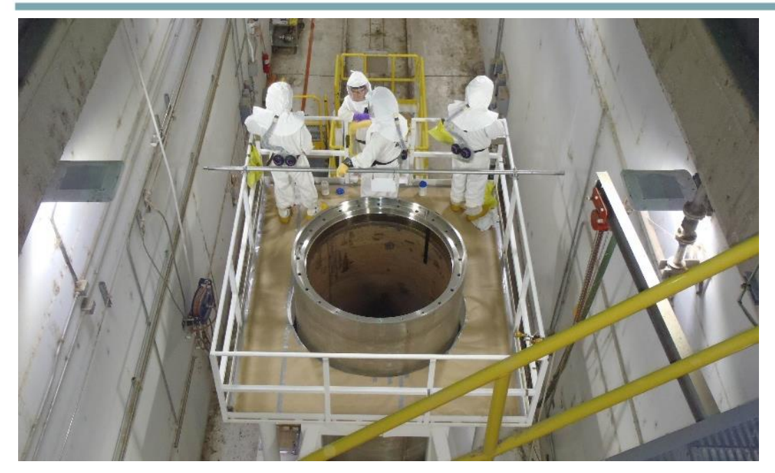
T Plant workers ship a container to K West Reactor Basin, where workers fill it with sludge.