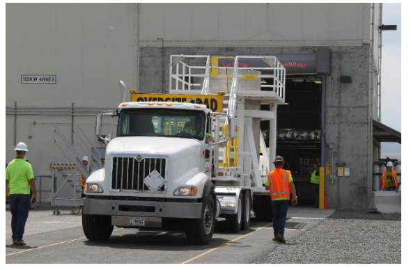
Workers safely prepare the sludge for transport from K Basin to T Plant.