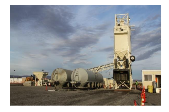
To mitigate traffic effects, workers constructed safeaccess roads and a grout batch plant.