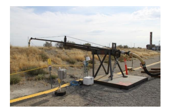
Crews apply the successes and lessons learned from Tunnel 1.