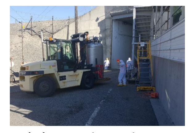
A sludge container arrives at T Plant for interim storage.