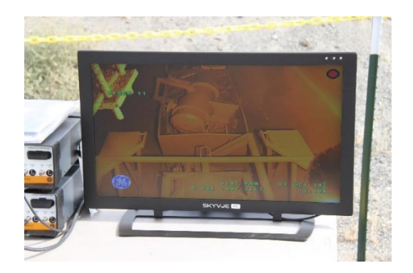
Workers monitor radiological and industrial hygiene continuously during grouting operations.