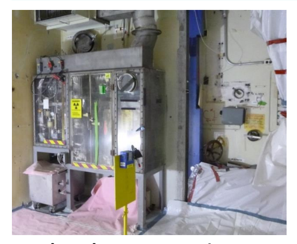
Workers began removing a glovebox at the 324 Building to support installation of remotely operated equipment.