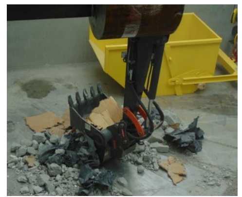
Crews at the 324 Building mock-up installed and tested the first remotely operated excavator.