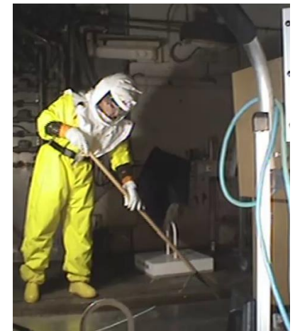
Radiological cleanout of airlock trench