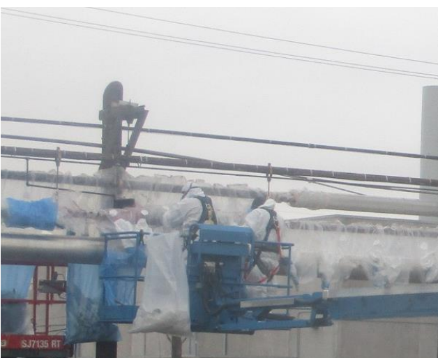
Workers removing asbestos-clad steam lines