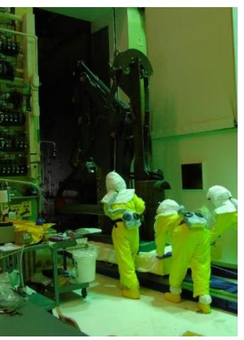
Following testing and training in a mock-up, crews install first remote excavator