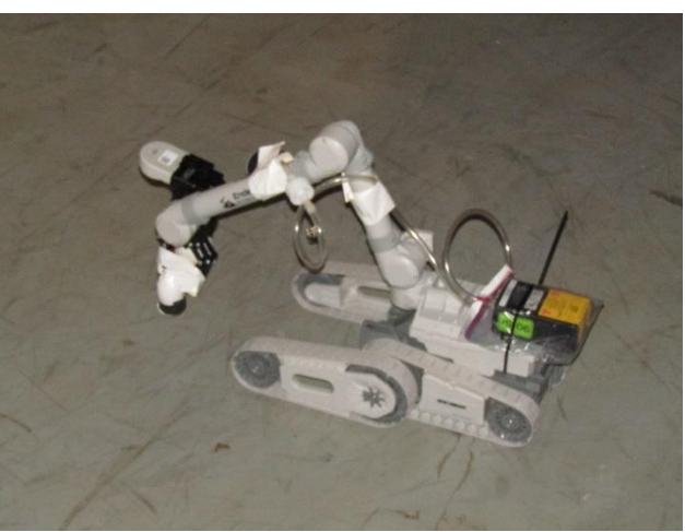
Robot with sampling equipment used to check radiological conditions