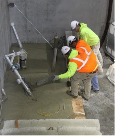
Grout and debris added at mock-up to simulate B-Cell flooring