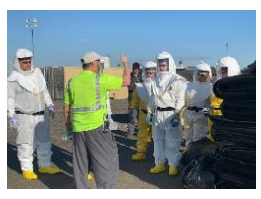
Mentoring new workers