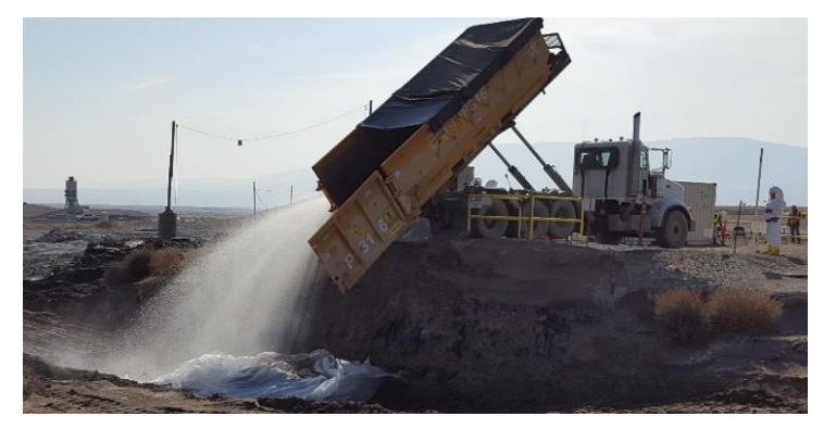
Disposing of debris at Environmental Restoration Disposal Facility