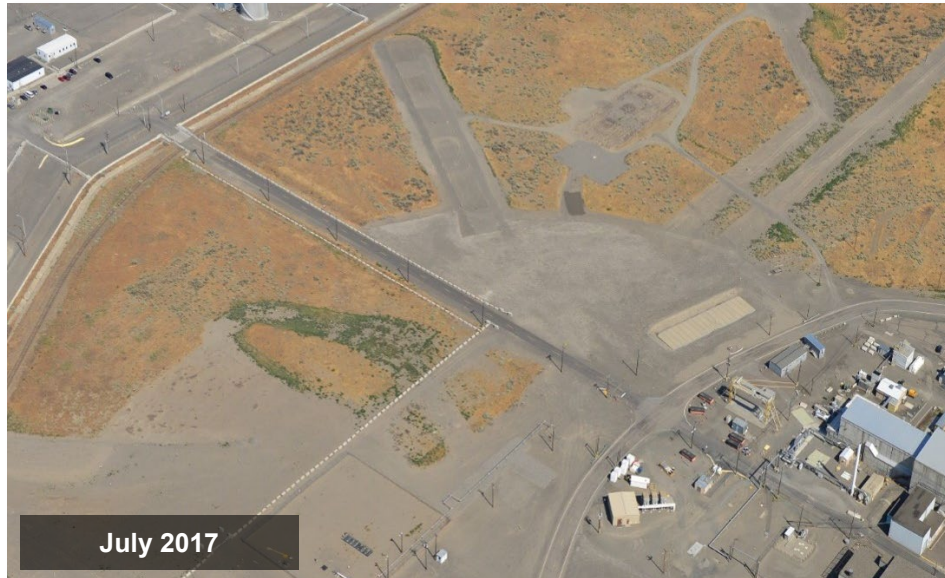
Dry-Storage Area before construction