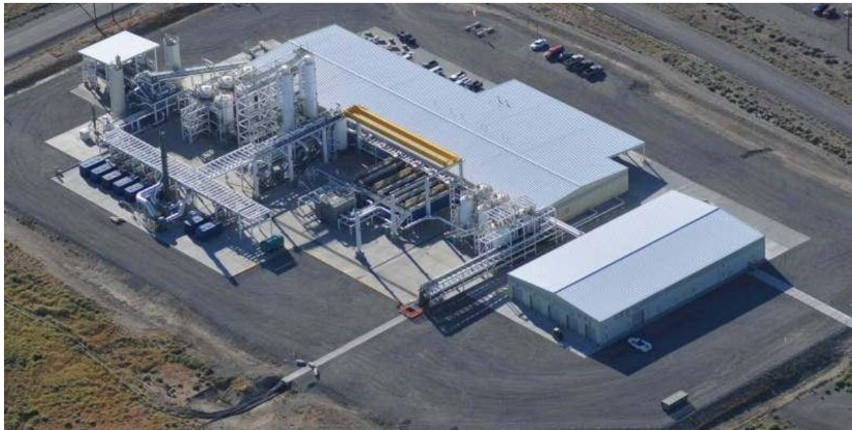
The 200 West Pump and Treat Facility has been operational since 2012

We have treated 2.2 billion gallons (or more) of groundwater for the last seven years in a row