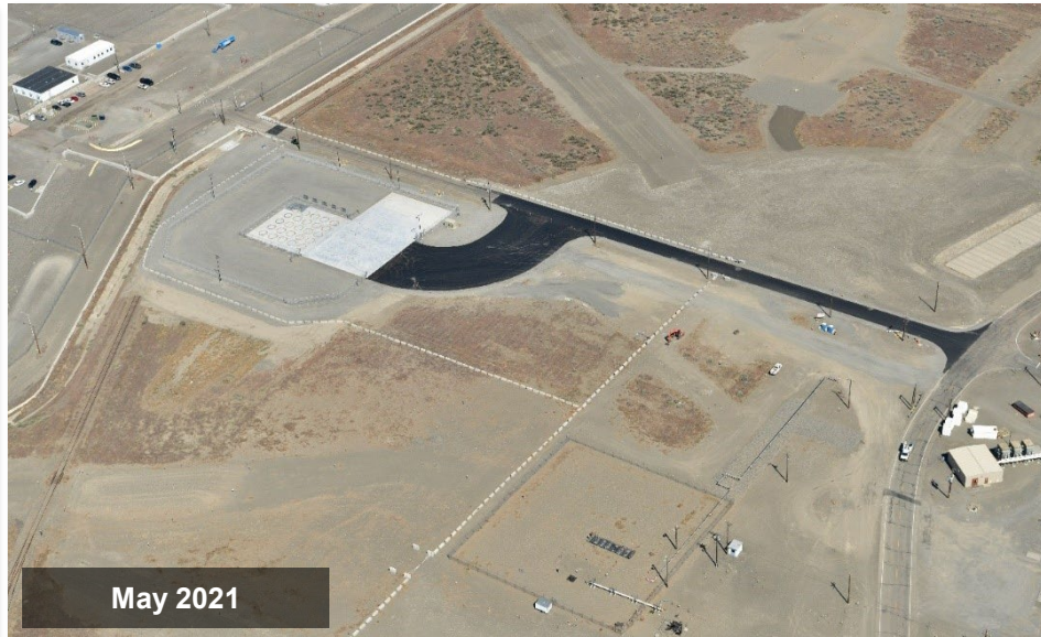
Dry-Storage Area construction complete