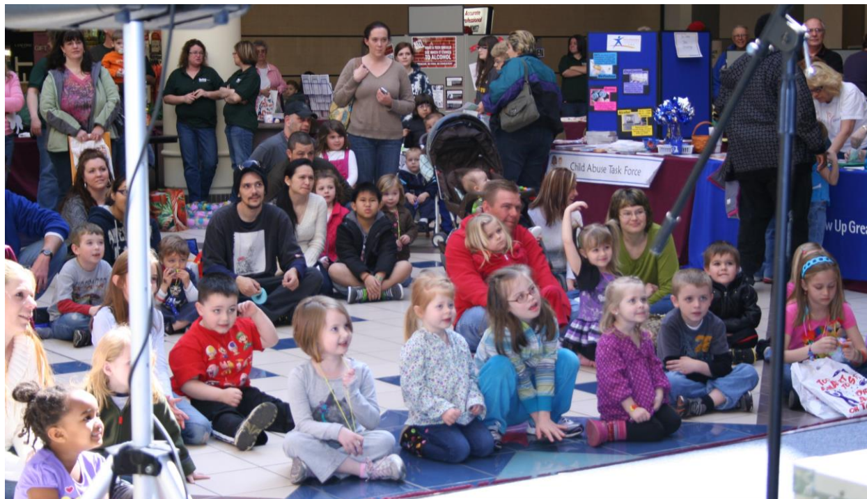
Bringing Local Partners Together: Allegany School Readiness Fair

In addition to offering a common definition for talking about family engagement and aligning strategies across and between statewide agencies and providers, the Framework also serves as the starting point for developing policies to evaluate the effectiveness of family engagement interventions. According to Maryland's Race to the Top–Early Learning Challenge application, the Coalition will be responsible for creating “outcome measures” for each outcome in the Framework. 8 Eventually, the goal will be to create a “process by which Maryland can gauge the success of its family engagement practices.” 9