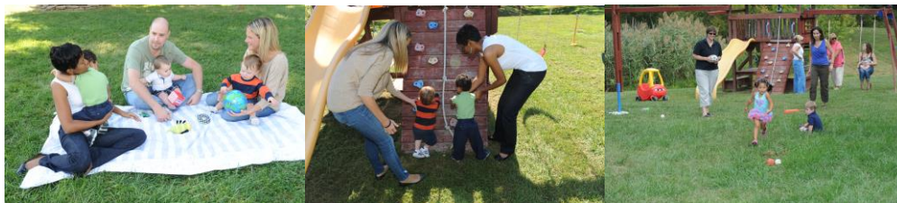
Healthy Beginnings is a set of guidelines and activities for families and early education providers that the Maryland State Department of Education, created in partnership with Johns Hopkins University, Center for Technology in Education.

child care and family support providers from a wide range of sectors and across the state. This diverse body has committed to a series of ambitious and measurable goals for family engagement and is incrementally building the capacity of stakeholders to achieve them. Capacity-building efforts such as training and technical assistance from the Maryland Family Network and the federally supported Maryland Head Start Training and Technical Assistance Program (T/TA) allow the state of Maryland not only to scale up family engagement approaches like Healthy Beginnings and the Strengthening Families Protective Factors, but also to pilot and launch new initiatives. Most promising of all, the Race to the Top–Early Learning Challenge grant has enabled Maryland to build the necessary infrastructure to ensure that every family in the state benefits from a sustained, consistent family engagement strategy implemented by well-trained, skilled early childhood providers.