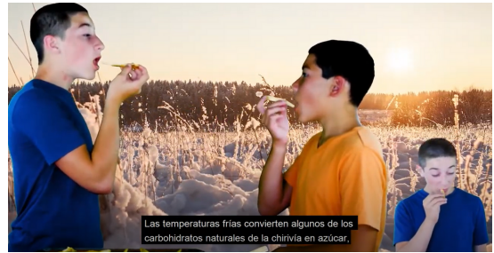
A Spanish language version of the Parsnips video .