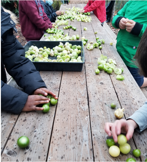
Peeling tomatillos at Powell Butte.

The Youth Grow team at Growing Gardens demonstrated how to make salsa verde at 6 schools, and sent 316 salsa verde kits home for kids to cook with their families! New Seasons market donated about 1000 lbs of fresh produce (tomatillos, onions, peppers, cilantro and lime) to supplement what students grew in their school gardens. The lesson celebrated culturally-specific food and inspired students to taste fresh produce.