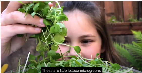
An English language version of the Microgreens video .