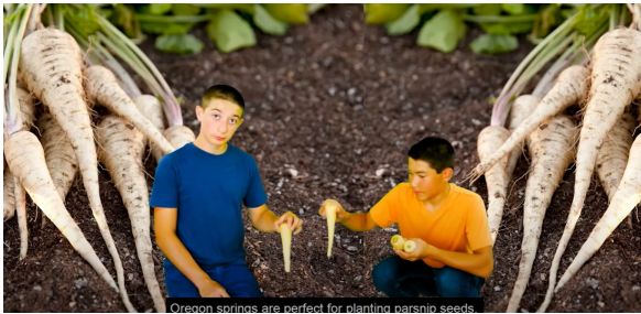
An English language version of the Parsnips video .

The month of December brings new additions to the Oregon Harvest for Schools (OH4S) video series; Parsnips in English and Spanish and Microgreens in English and Spanish!