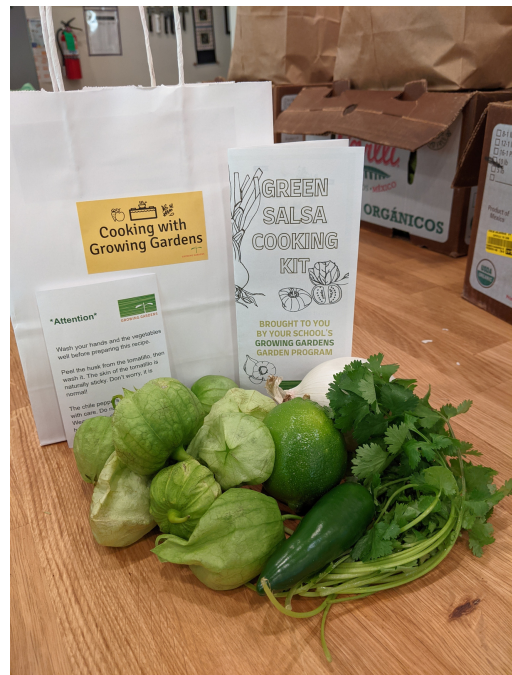
Green salsa cooking kits.