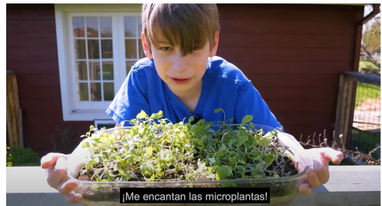
A Spanish language version of the Microgreens video .

The Oregon Department of Education's Child Nutrition Program and OSU Extension's Food Hero campaign have teamed up to launch this series which will include a total of 50 videos when complete. The series aims to educate students on healthy, Oregon food. For a comprehensive list of the videos we have available to date visit the Oregon Harvest for Schools website and click on the Videos tab under "Other Items."