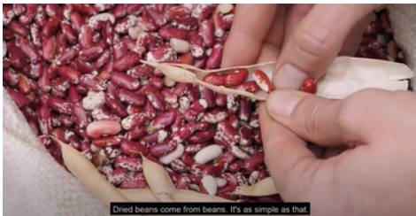
An English language version of the Dry Beans video .