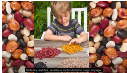
A Spanish language version of the Dry Beans video .

The Oregon Department of Education's Child Nutrition Program and OSU Extension's Food Hero campaign have teamed up to launch this series which will include a total of 50 videos when complete. The series aims to educate students on healthy, Oregon food. For a comprehensive list of the videos we have available to date visit the Oregon Harvest for Schools website and click on the Videos tab under "Other Items."