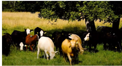
A Spanish language version of the Beef video .