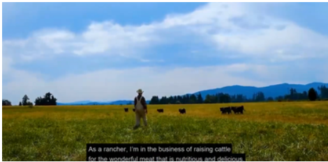
An English language version of the Beef video .

The month of January brings new additions to the Oregon Harvest for Schools (OH4S) video series; Beef in English and Spanish and Dry Beans in English and Spanish!