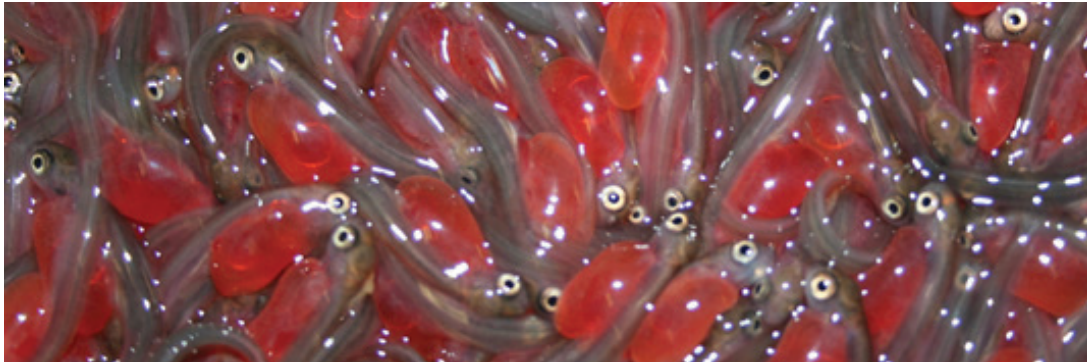
Spring chinook alevin or sac-fry hatched from eggs.

into the South Fork of the Walla Walla River. Needing additional broodstock, the Umatilla tribe was able to acquire an additional 250,000 spring chinook smolts from Carson National Fish Hatchery in Carson, Washington as a result of a U.S. v. Oregon † Interim Management Agreement. In 2005 the Umatilla tribe successfully reprogrammed these fish for release into the South Fork Walla Walla.