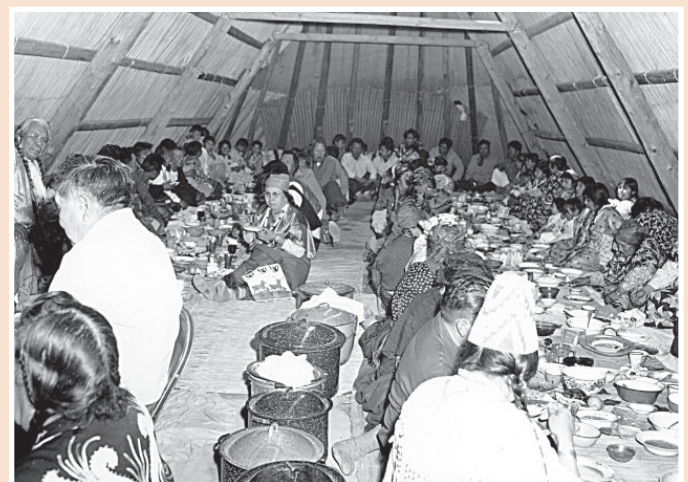
A salmon feast at a tribal longhouse. Salmon and water are the first of the First Foods. In the spring, when the tribes celebrate the salmon's return, tribal longhouses and churches must have spring chinook—no other fish will do—for their First Salmon ceremonies.

To jump-start the program, the tribe released surplus Umatilla and Ringold adult spring chinook