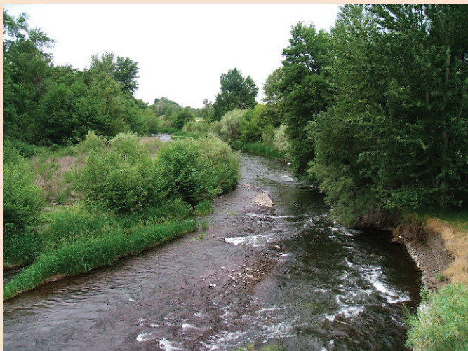
Walla Walla River near Stone Creek

years when adults from Carson hatchery were first outplanted in 2000. The current level of natural production was reestablished from these Carson stock outplants. To improve natural production in the system, the proposed program would naturalize a run and work to build genetic and life-history diversity through best management practices and progressive hatchery actions. The master plan’s guidelines aim to create a “localized” stock and minimize hatchery effects on the reestablished natural populations. The recent returns of naturally reared fish derived from Carson stock adults outplanted in the Walla Walla seem to be performing well.