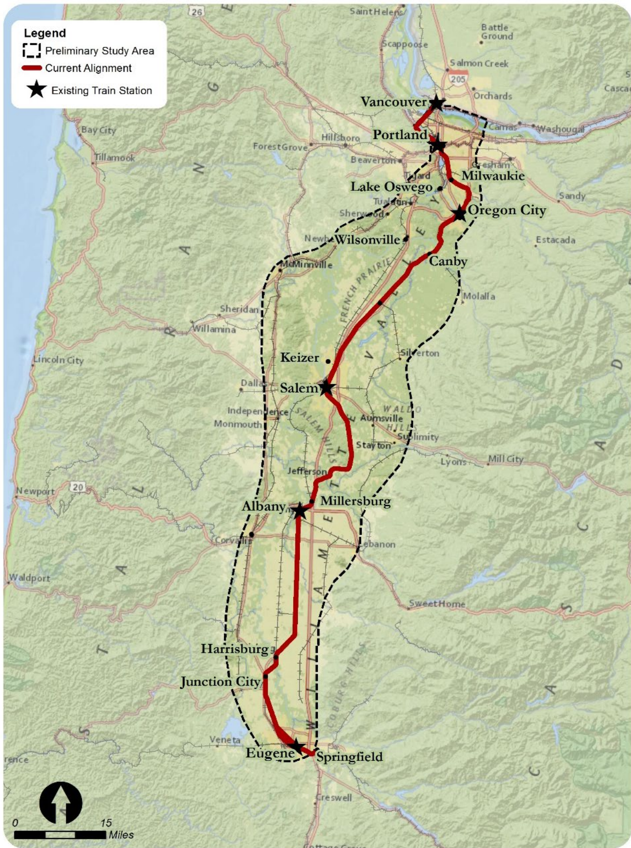
Figure 1-1. Oregon Passenger Rail Study Area and Existing Route