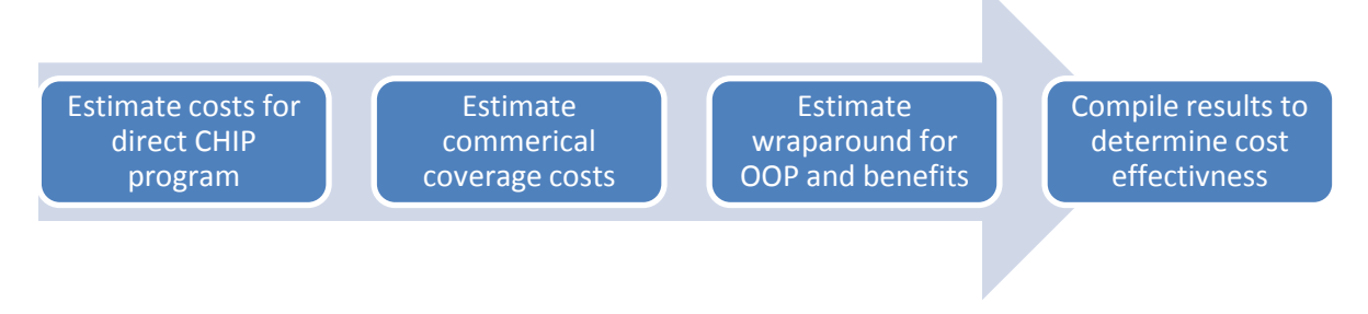
Figure 2. Method for Determining Cost Effectiveness (2017)

Figure 2 illustrates the method used to determine cost effectiveness for a CHIP premium assistance program in Oregon. The analysis began by estimating premium and administrative costs for providing direct CHIP coverage in CY 2017, using available historical Medicaid data. To estimate the number of CHIP enrolled children that would be eligible for premium assistance between 200-300% FPL, OHA's Office for Forecasting, Research and Analysis used caseload data from fall 2014. An estimated 16,458 would be eligible. We then estimated premiums for Marketplace coverage in Oregon, projecting costs to 2017. Finally, we compared the estimated costs for offering premium assistance (i.e. the cost of subsidizing children's premiums, and wrapping benefits and OOP costs) through QHPs with direct CHIP coverage to determine cost effectiveness.