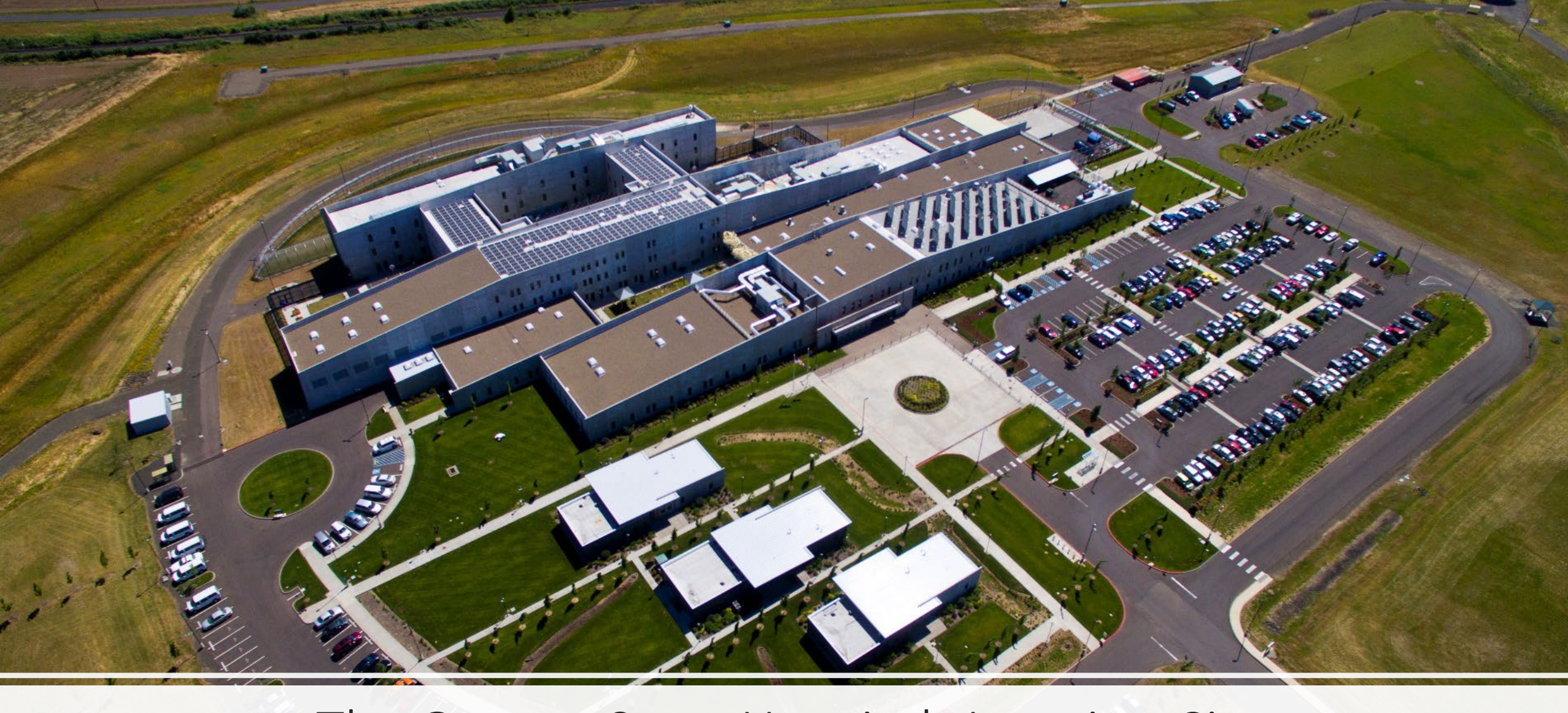
The Oregon State Hospital: Junction City