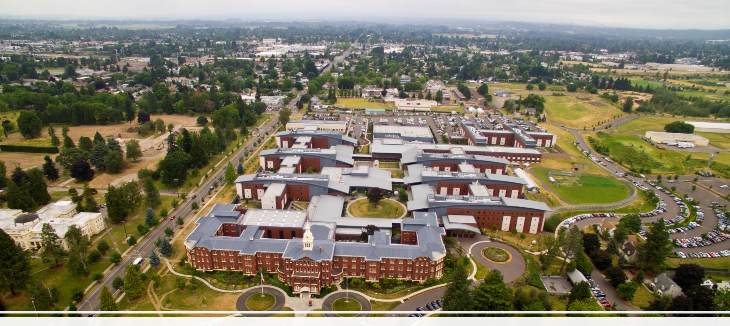
The Oregon State Hospital: Salem