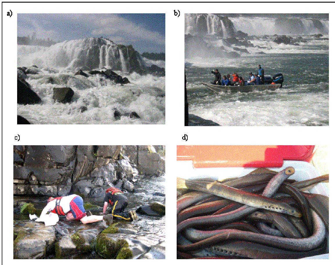
Figure 1. The Confederated Tribes of Siletz Indians 2004 Lamprey: a) Willamette Falls, b) approaching the Falls, c) searching for lamprey among the rocks, and d) a cooler full of lamprey.

On June 28, 2004, SHINE staff member Dave Stone accompanied members of the Siletz Tribe and their biologists to Willamette Falls to observe how the tribe harvests lamprey. A motorized boat guided the harvesters to rocky embankments below the falls so that lamprey could be collected among the rocks (Figure 1). The lamprey were placed in canvas sacks, and when the sacks were full the harvesters returned to the boat. Lamprey were counted and placed into coolers. Approximately 500 lamprey were collected on this trip. On July 6, 2004, approximately 500 more lamprey were collected for a total harvest of around 1,000 for the 2004 season [3].