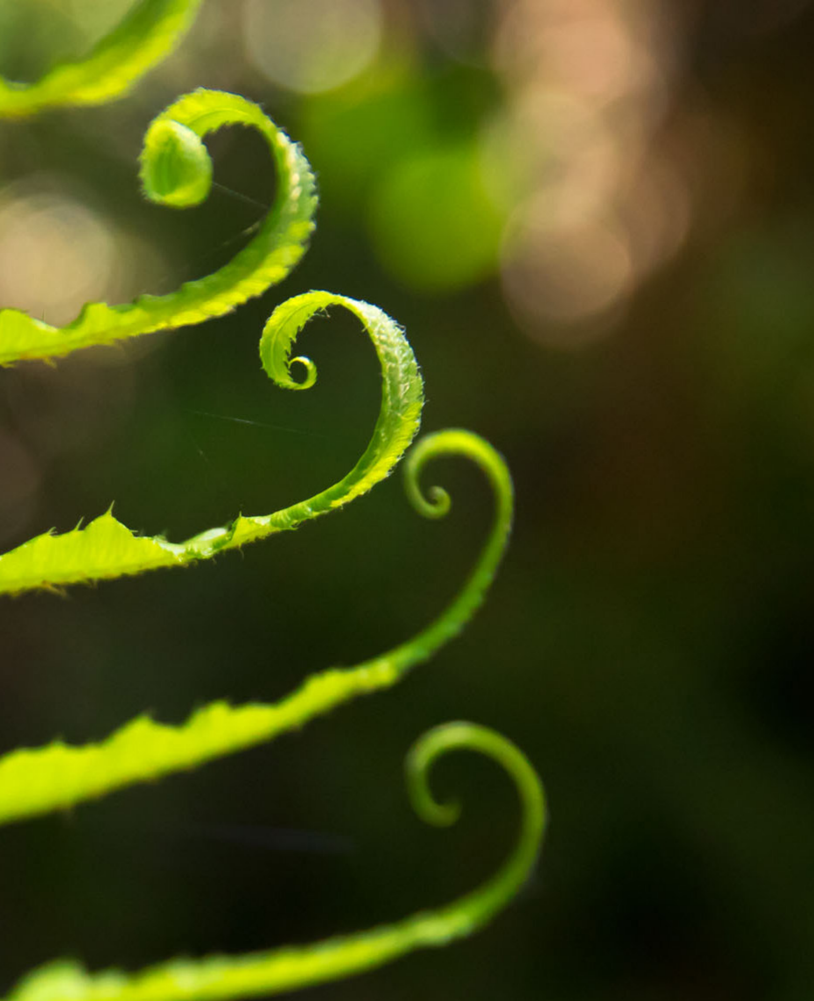
Fern at Tryon Creek State Park • Photo credit: Karen Bettin (2016)