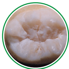
PITS AND GROOVES

A dental sealant is a liquid coating applied to the chewing surfaces of the back molar teeth to prevent cavities. The coating flows into the deep pits and grooves of the tooth "sealing out" bacteria and food debris that cause cavities.