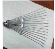
RAKE Part#: 889-1