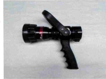
1.5 NH Automatic Nozzle 60-125 GPM Part #: 537P-15214