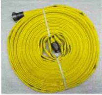
1 IN FORESTRY HOSE (TYPE 2) 1 X 100 YELL NH AL Part #: 1125-1031007