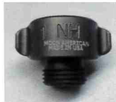
1 F NH X .75 M GH Part #: 369-1020754