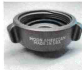
2.5 F NH X 1.5 M NH Part #: 369-2521524