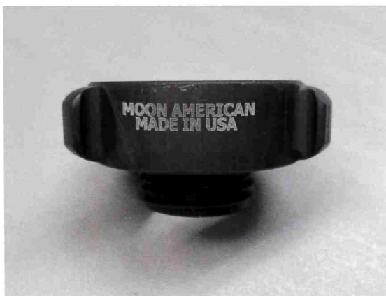
1.5 F NH x 1 M NH Part #: 369-1521024