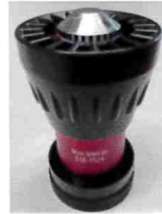
1 1/2 COMBO NOZZLE 20-60 GPM Part #: 516-1524