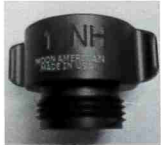
1 F NH X 1 M NPSH Part #: 369-1021014