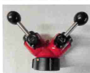
GATED WYE 1.5 F NH X (2) 2.5 M NH Part #: 430-2521524