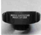
1.5 F NH X 1 M NH Part #: 369-1521024