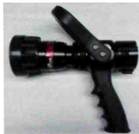
1.5 NH AUTOMATIC NOZZLE 60-125 GPM Part #: 537P-15214