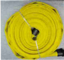
1 1/2 IN FORESTRY HOSE (TYPE 2) 1.5 X 100 YELL NH AL Part #: 1125-1531007