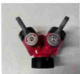
GATED WYE 1.5 F NH X (2) 1.5 M NH Part #: 429-1521524