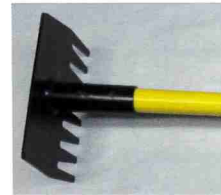
MCLEOD Part#: 888-505