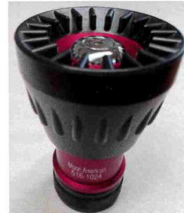
1 in Combo Nozzle 10 - 24 Part #: 516-1024