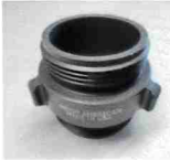
DOUBLE MALE 2.5 X 2.5 NH Part #: 378-2522524