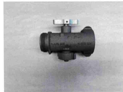
Inline "T" 1.5 NH x 1" NH w/ Shutoff Part #: 427-15210294