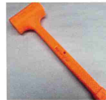
RUBBER Mallet - 2LB Part#: 881-2