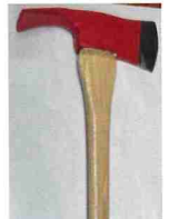
PULASKI Part#: 881-3635