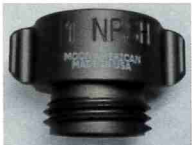
1 F NPSH X 1 M NH Part #: 369-1011024