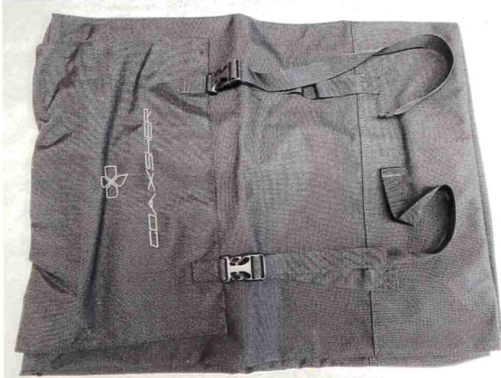
Bag Part #: 1399-221869