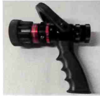
1" NH SELECT GALL NOZZLE 13-60 GPM Part #: 512P-10214