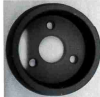
MOUNTING BRACKET Part#: 861-2524