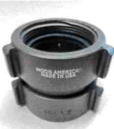
DOUBLE FEMALE SWIVEL 2.5X2.5 NH Part #: 379-2522524