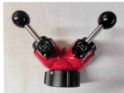
Gated Wye 2.5 F NH X (2) 1.5 M NH Part #: 430-2521524