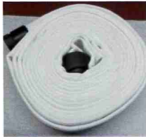
3IN STRUCTURAL HOSE 3 X 50 DJ 800# WHITE W/ 2.5 NH AL Part #: 1129-308050254