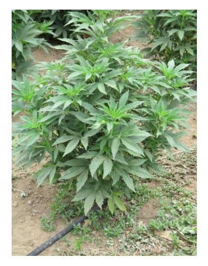
Hemp plant (left) and hemp under stereomicroscope (above)

It was hard to believe that there were no visual clues that corresponded to the lower level of THC - perhaps smaller flowers (buds), less of a distinct odor, or a different plant shape. However, after careful examination of both types of plants, the chemists determined that hemp is visually consistent with marijuana. Aside from the regulations surrounding marijuana grows, like fencing, camera requirements, and other security measures, there is nothing that visually differentiates marijuana from hemp.