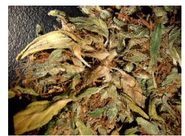
Marijuana plant (left) and marijuana under stereomicroscope (above)