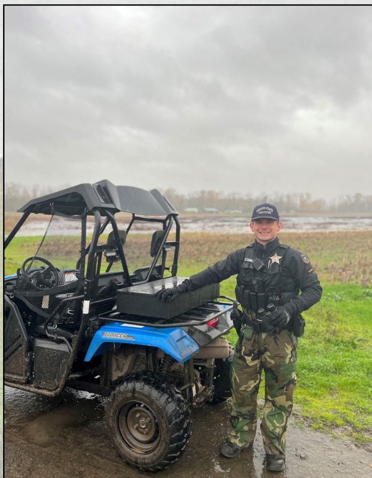
On the cover: A Fish and Wildlife Trooper on patrol in the Sauvie Island Wildlife Area