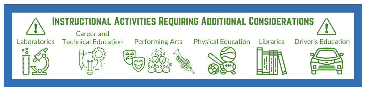
Figure 5: Instructional and Extra-Curricular Activities Requiring Additional Considerations <u>Image version</u> of Figure 5

Providing opportunities for a well-rounded education is vital for the education of students and amplified during the time of COVID-19 related restrictions to support student well-being and connectedness. It is critical that schools continue to offer options for a well-rounded education whether On-site, Hybrid or