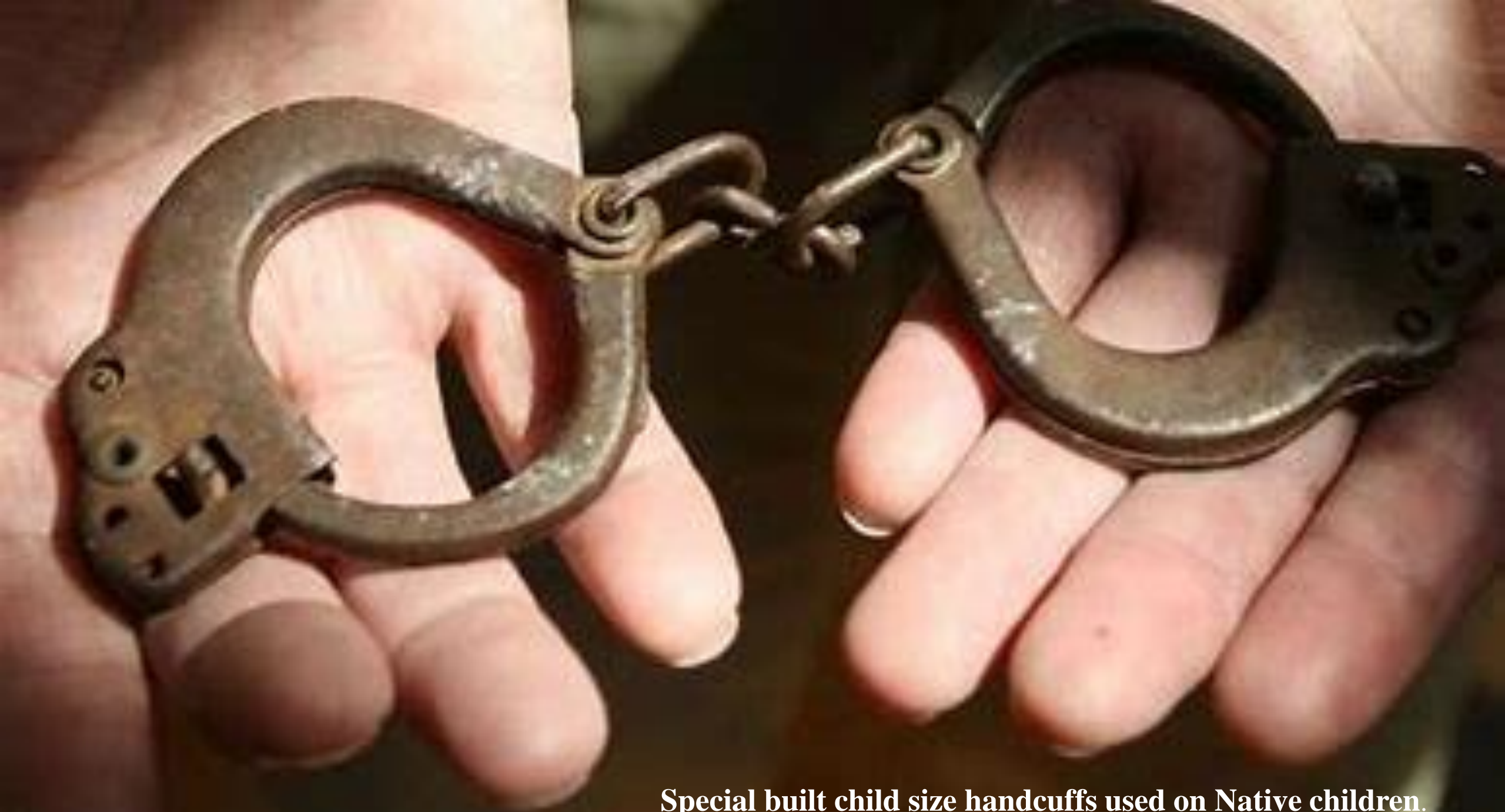
Special built child size handcuffs used on Native children.