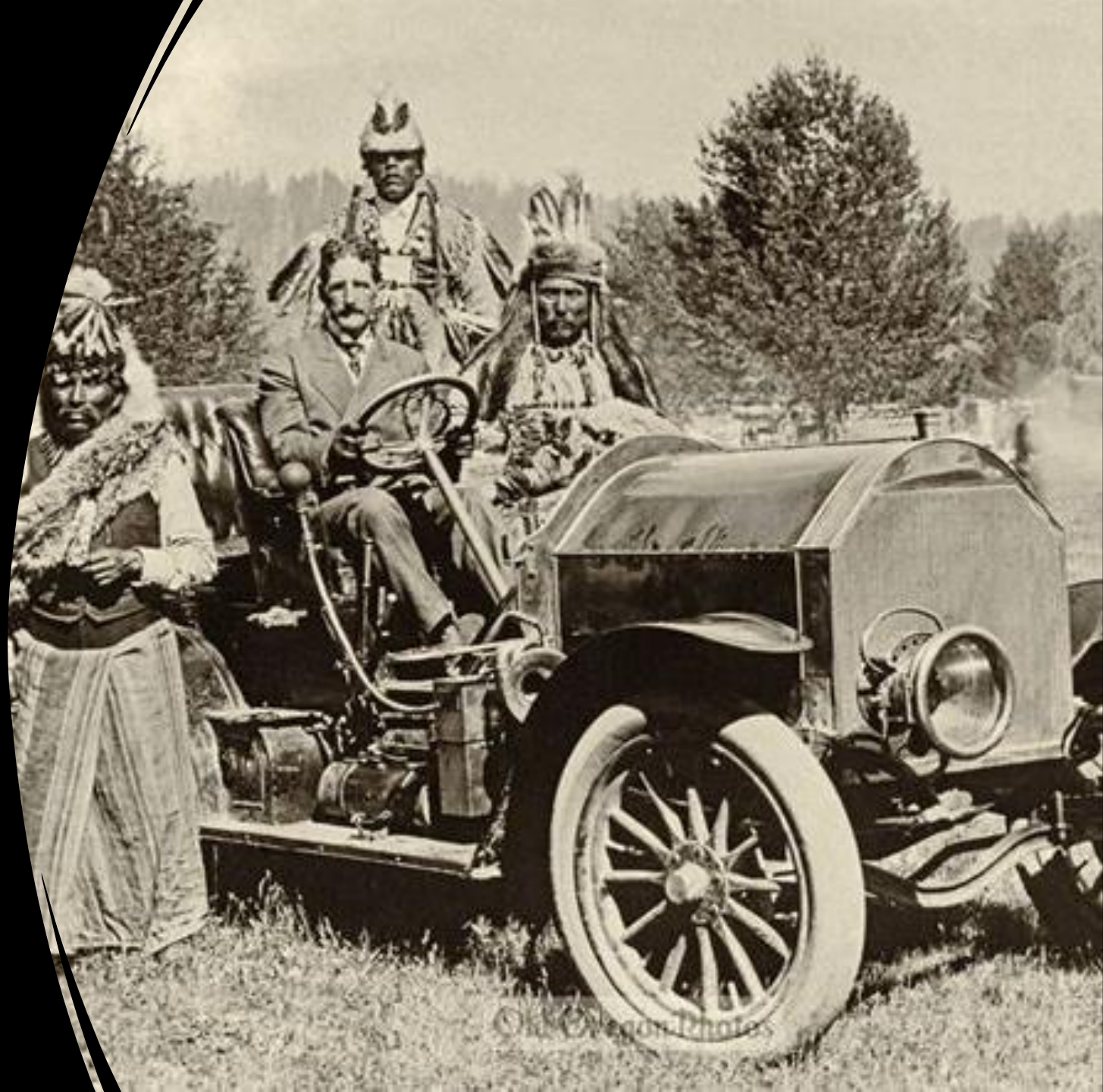
Image- 3 Klamath men join the driver of this early automobile the original title given by the photographer was "Savage" taken in 1908