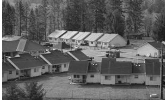
Housing on Siletz Reservation Siletz, OR