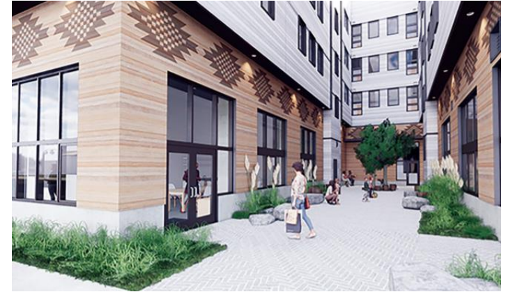
Mamook Tokatee apartments Portland, OR (design rendering)