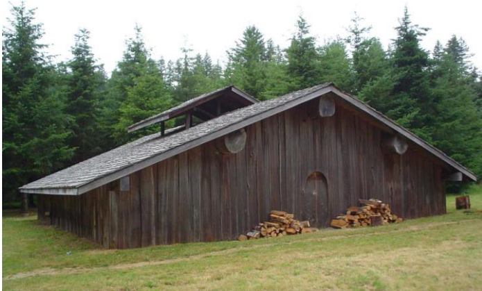
Cedar plank house on Siletz Reservation Siletz, OR