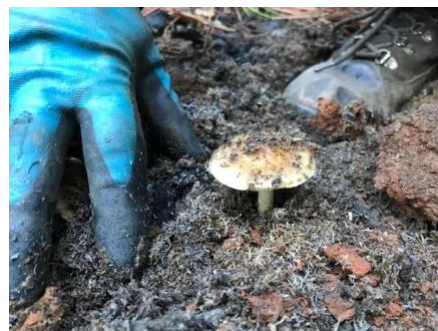
Top: Planting trees in biochar amended soil, Rogue-Siskiyou National Forest. Bottom: Biochar produced on site and left for forest soil improvement at the Drew Veg Stewardship Contract, Umpqua National Forest