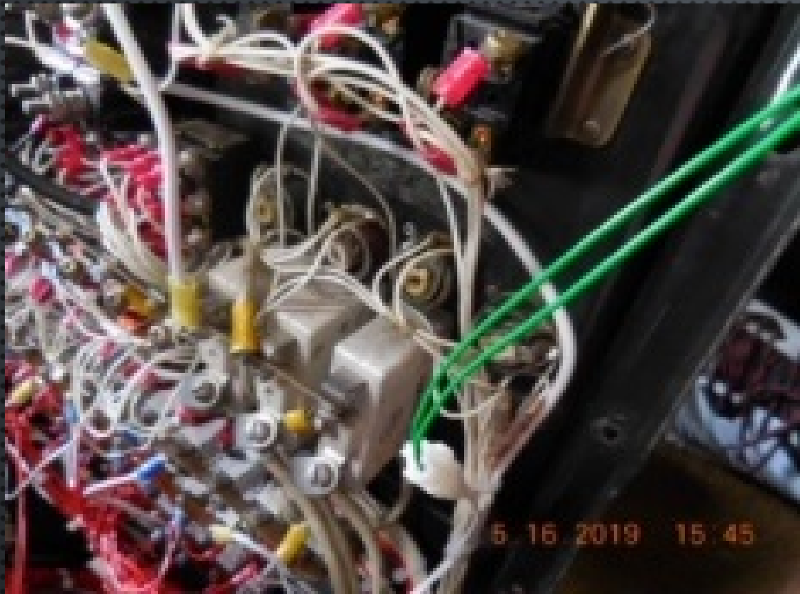
Navigating the maze of wires to find the non NVG bulbs to document part numbers