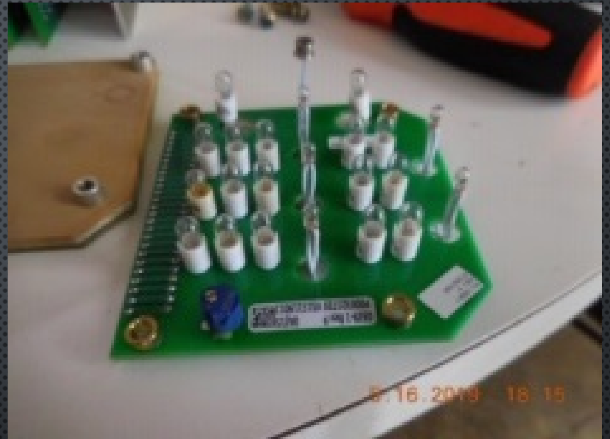
23 bulbs for one instrument All 23 bulbs will be replaced with NVG compatible bulbs