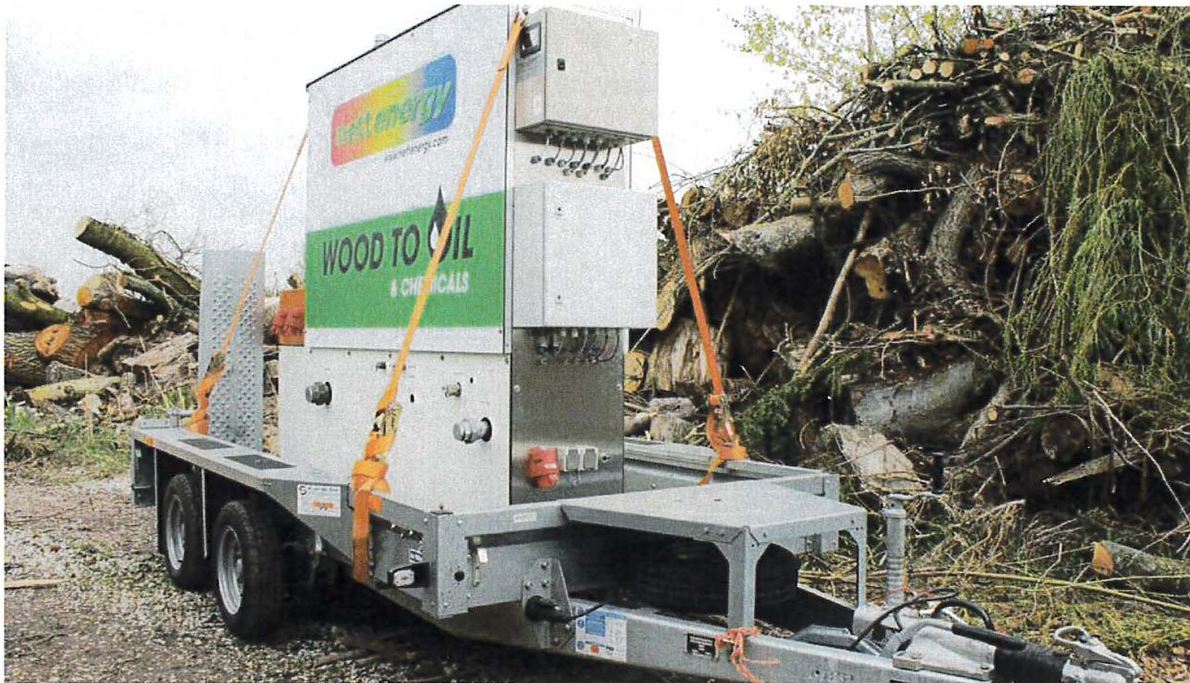
Nettenergy's 2 tonne (per 24 hours) autarkic** mobile pyrolysis plant. Their 10-ton unit processes five times as much biomass per day.

Nettenergy v makes farm- and forest-size pyrolysis units in the Netherlands, and sells them as far as Australia. Running continuously, their 10-tonne unit (fits in a 40-foot shipping container) produces 2500 liters of biocrude oil with a HHV of 24 MJ/l,* 1,000 kg of biochar, and 2500 liters of wood vinegar every day, plus syngas equal to 50 kW/h for every hour of operation. You could do a lot with 50 kWh, times 24 hours a day = 1200 kWh, if you could affordably get that syngas out of the woods.