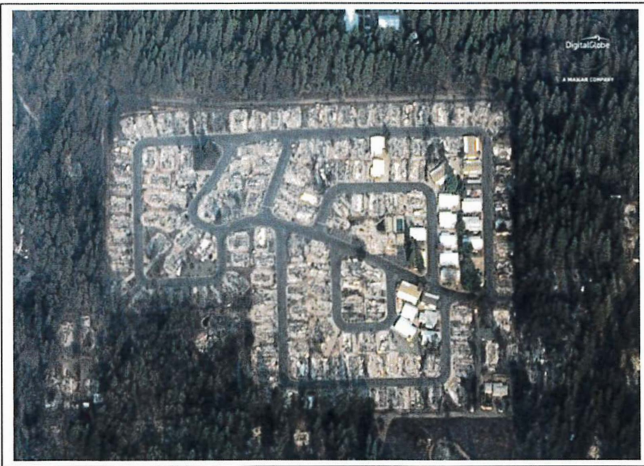
Figure 1. Camp Fire, showing the devastation of homes in the Kilcrease Circle community of Paradise. Note the surrounding green, mature forest with little or no scorching. The homes were not burned by a high-intensity crown fire, but were ignited by embers, followed by home-to-home ignitions. 11/17/2018.

http://forestpolicy.com/2019/01/09/letter-to-president-trump-from-govs-newsom-brown-and-inslee/