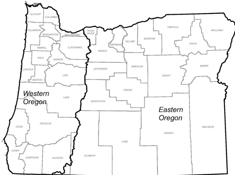
Figure 1: Western Oregon and Eastern Oregon Geographic Regions

Statutory/Other Authority: ORS 527.710; section 2(1), chapter 33, Oregon Laws 2022