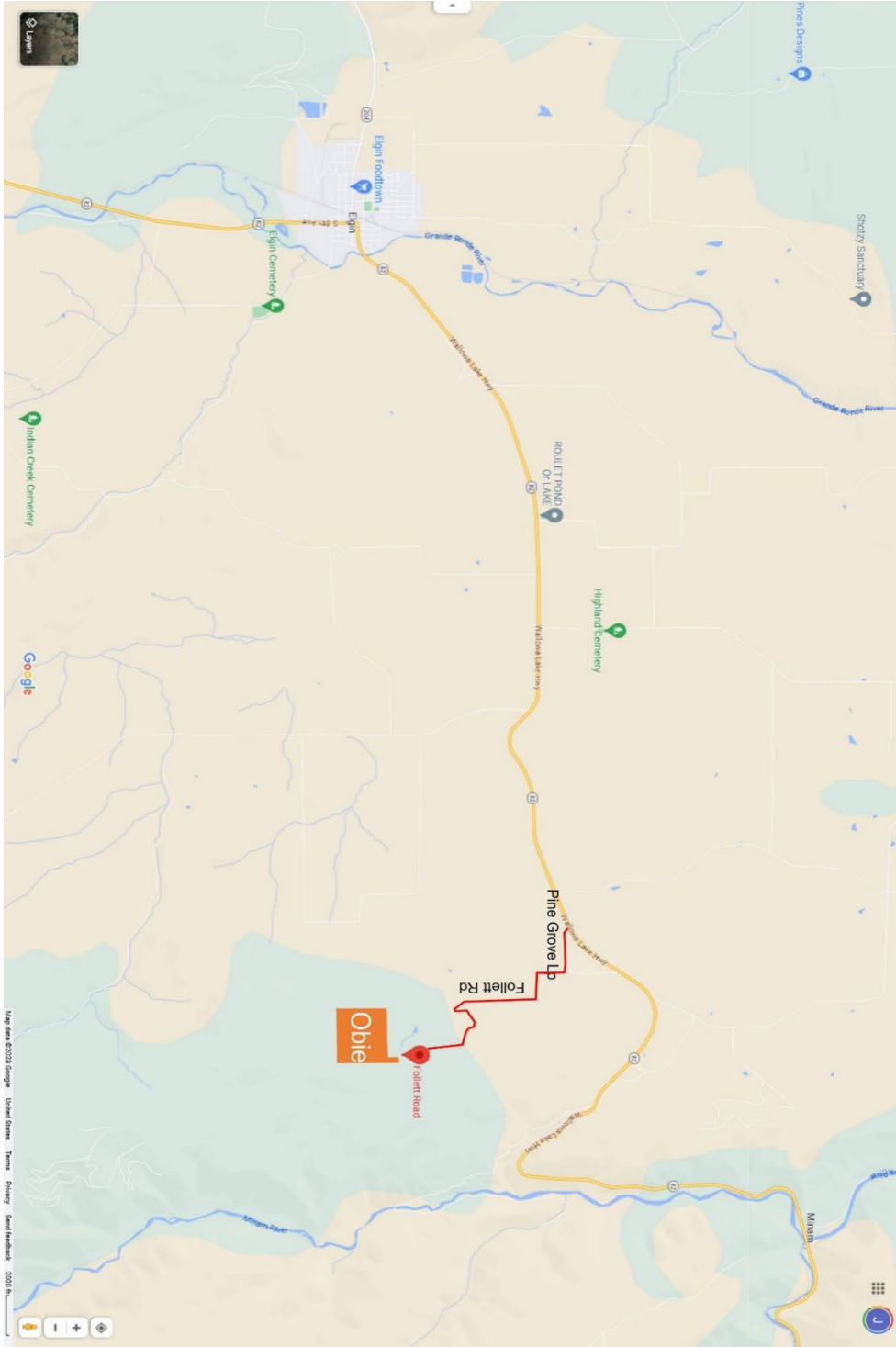
Obie Vicinity Map A