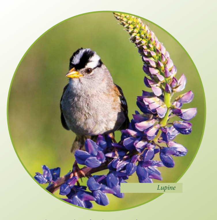
Native plants are beneficial to Oregon's native songbirds like this White-crowned sparrow.

An easy-to-grow perennial with arching green leaves and clusters of fragrant small flowers. Select a partly sunny spot for this interesting plant.