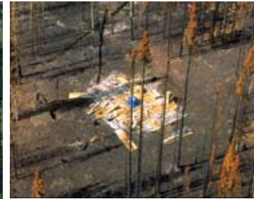
Fuel reduction around a home can keep a wildfire emergency from becoming a disaster.