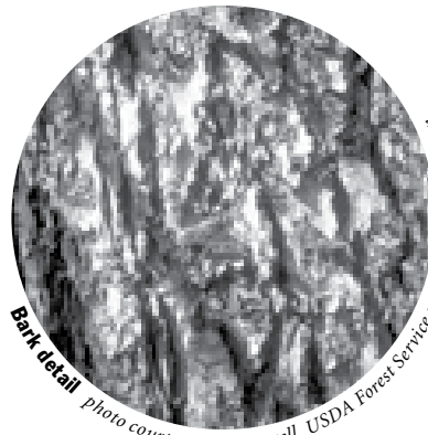
Bark detail photo courtesy Dave Powell, USDA Forest Service, www.forestryimages.com