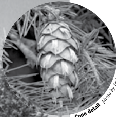
Cone detail