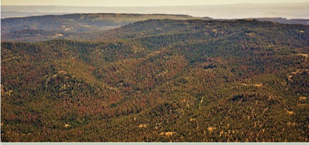
Over 1 million acres with true fir mortality from drought and subsequent bark beetle attack was detected in 2022 aerial surveys.

Drought damage is intensified for tree species that are less drought-tolerant such as western hemlock, true fir, and western redcedar or for any species growing on the fringe of their preferred range. And the preferred range of some less droughttolerant species appears to be shifting or shrinking due to these changing conditions.