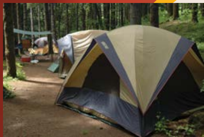
Gales Creek Campground