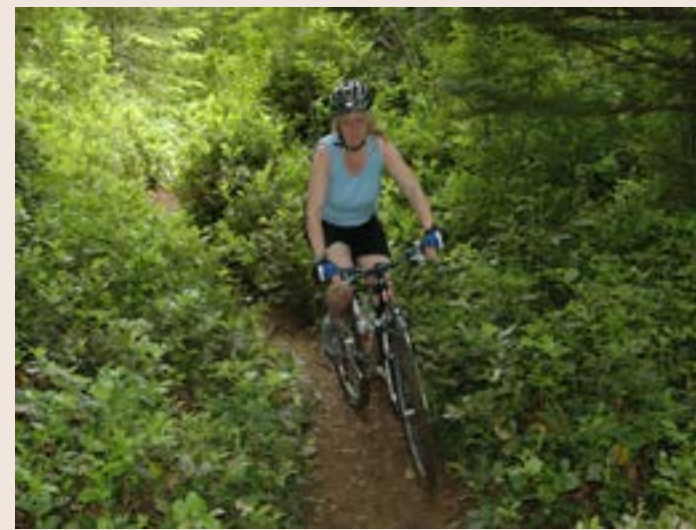
Gales Creek Trail

Enjoy a variety of more than 80 miles of non-motorized trails on the Tillamook State Forest. Whether you prefer hiking, mountain biking, or horseback riding, there is a trail for you. Enjoy a spring wildflower show while hiking the Peninsula Trail. Pedal your mountain bike on the Historic Hiking Loop Trail for a rocking good ride. If you're looking for a steep hike to a mountain-top with inspiring views, tackle the Kings Mountain Trail. Some trails may be closed seasonally to protect them from damage. Please remember to share the trail and abide by regulations on posted signs. A series of detailed trail guides are available at district offices, the Tillamook Forest Center, and on our websites .