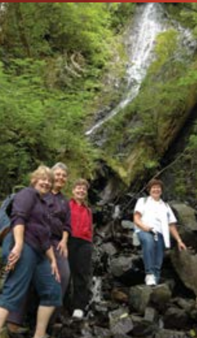
Hikers enjoying Wilson Falls along the Wilson River Trail