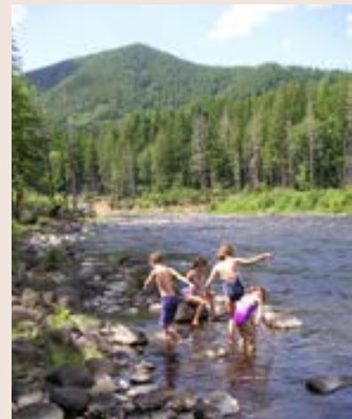
Smith Homestead Day-use Area

Day-use areas, highway waysides, and scenic overlooks are located throughout the forest. Most picnic sites offer a shady oasis near streams and easy trails. The Smith Homestead, Jones Creek Day-use Area, and Keening Creek Campground are popular places located near the Wilson River off Highway 6. The rustic Forest Learning Shelter at the Smith Homestead can be rented for private events by contacting the Tillamook Forest Center.