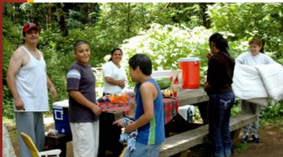
Picnicking in the Jones Creek Day-use Area