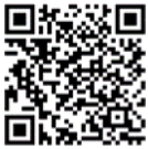
ODF Interactive Fire Restrictions Map