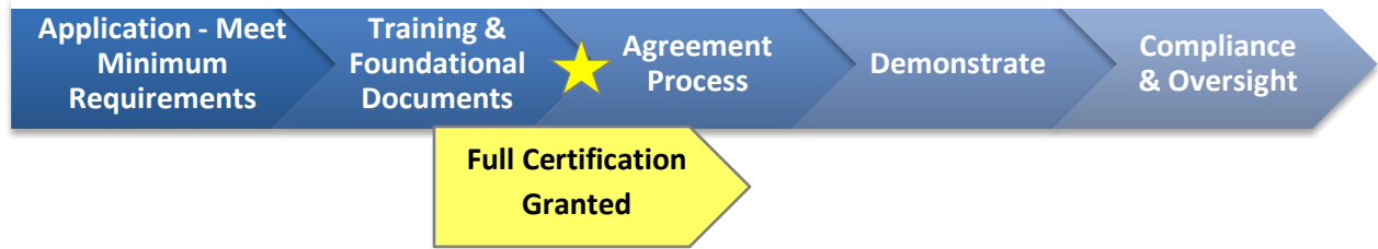
Figure 2: Five phases of certification, with certification status conferred as indicated by the star