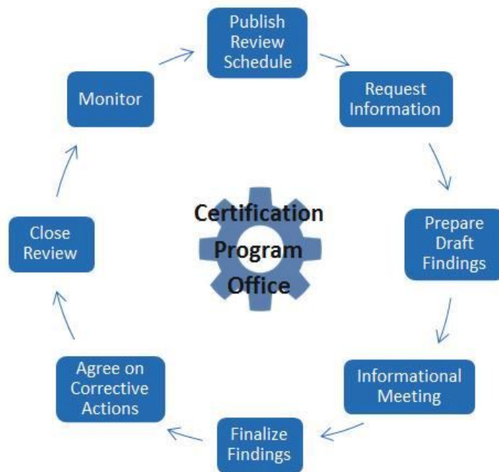
Figure 3: Compliance Review Cycle

Continued certification status is contingent upon the Certified LPA continuing to meet Certification Program requirements and maintaining qualified and experienced staff. The compliance and oversight portion of the Certification Program is designed as a three-tiered approach. The components include an annual Certified LPA self-audit along with annual project reviews and triennial program reviews by the Certification Program Office. See Section B for more details. The project and program review steps are as illustrated in Figure 3 below.