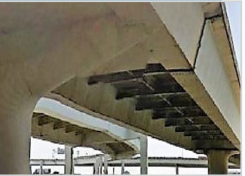
Freeway joint on I-405 from below

Many sections of the freeway will also be resurfaced, causing less wear and tear on drivers' vehicles.