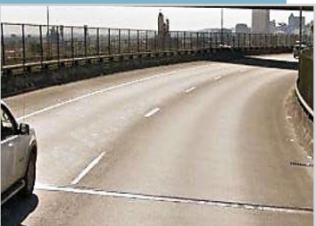
Freeway joint on I-405

SIGN UP FOR PROJECT UPDATES: WWW.I405RAMPS.ORG