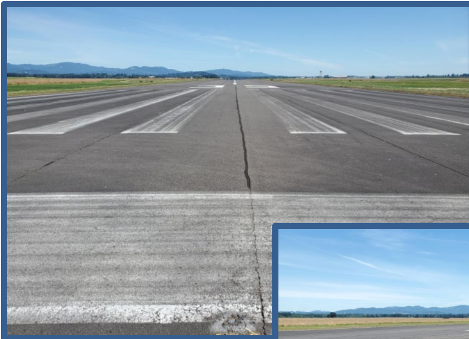
New pavement wearing surface and runway markings