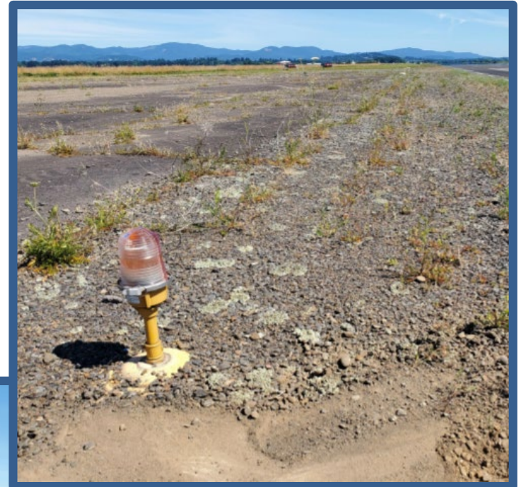
Replace failed edge lighting