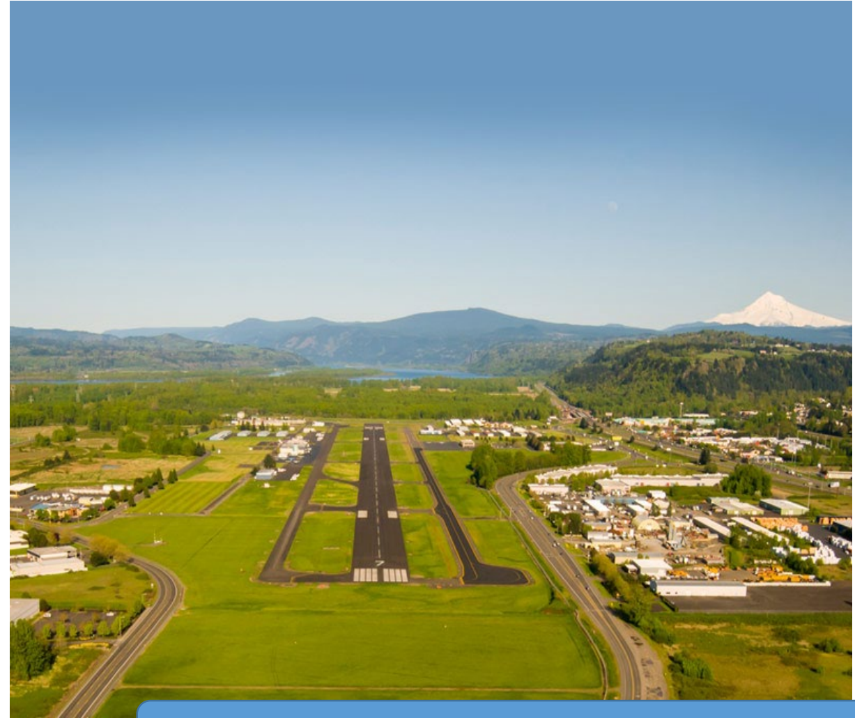
Troutdale Airport