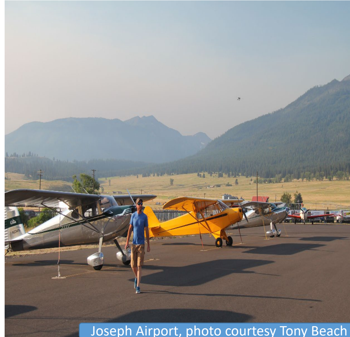
Joseph Airport