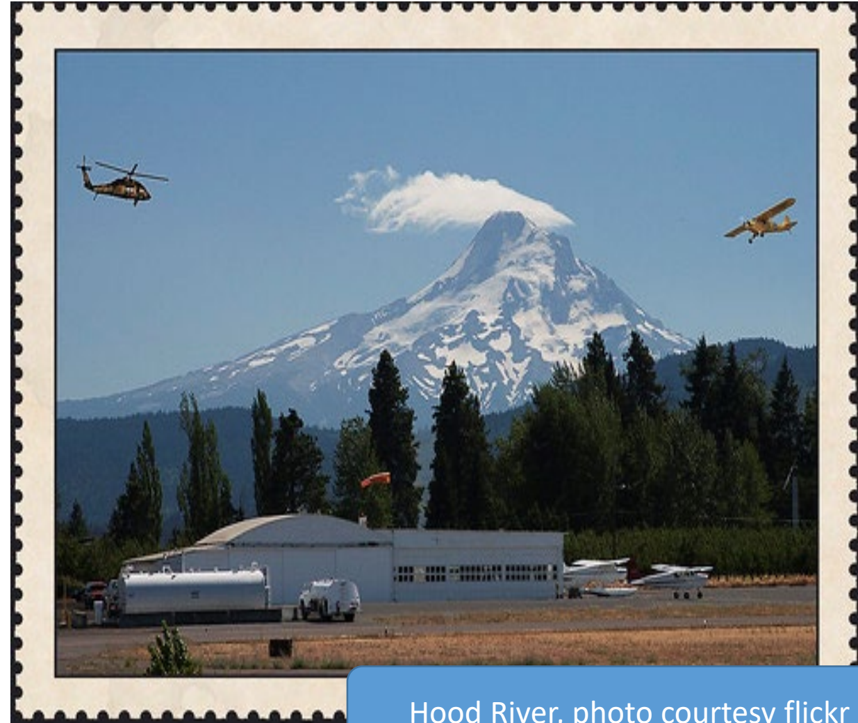
Hood River