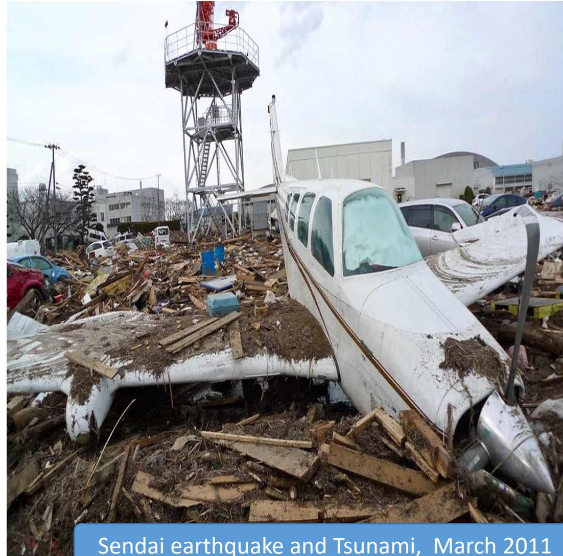
Sendai earthquake and Tsunami, March 2011