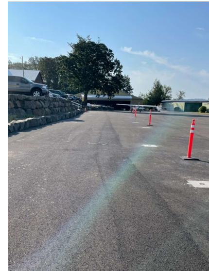
Twin Oaks 2021 COAR grants – Runway Repaving, Backup Generator, Parking Ramp Tie Downs