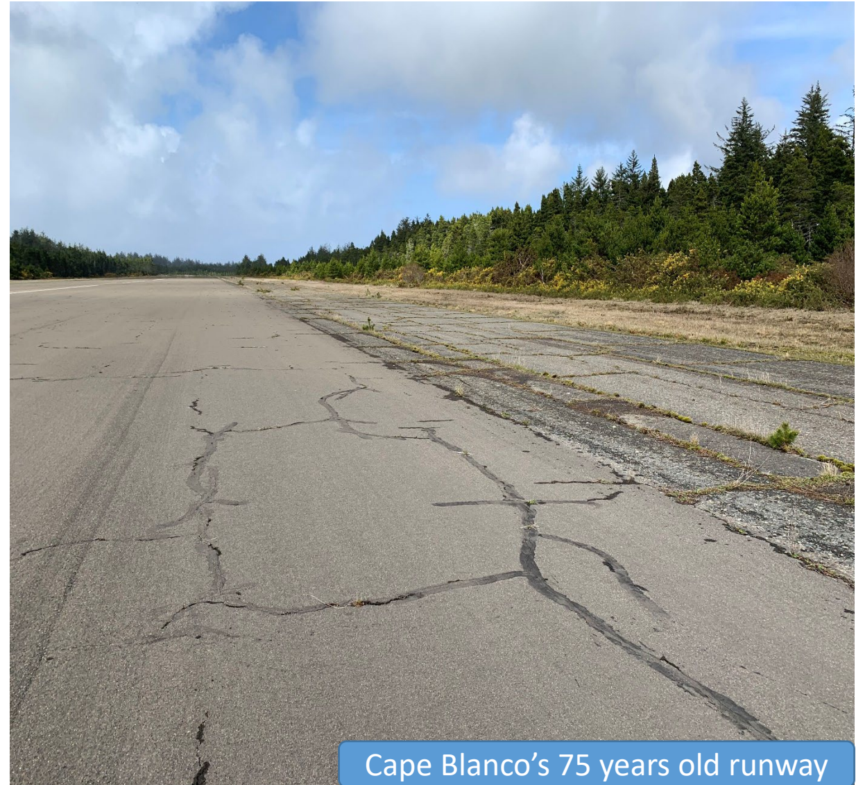
Cape Blanco's 75 years old runway