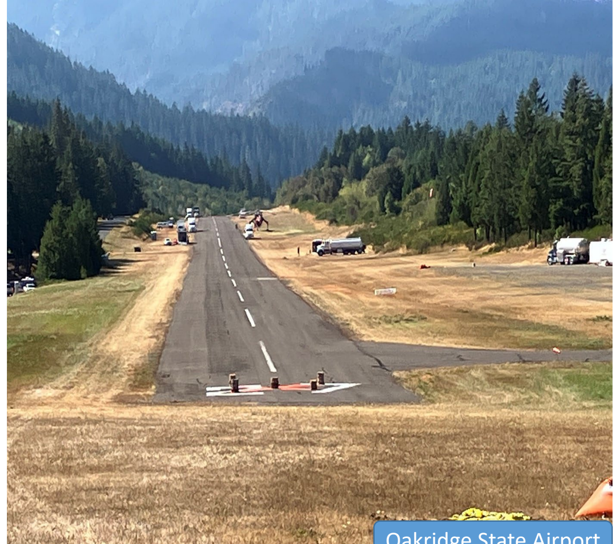
Oakridge State Airport