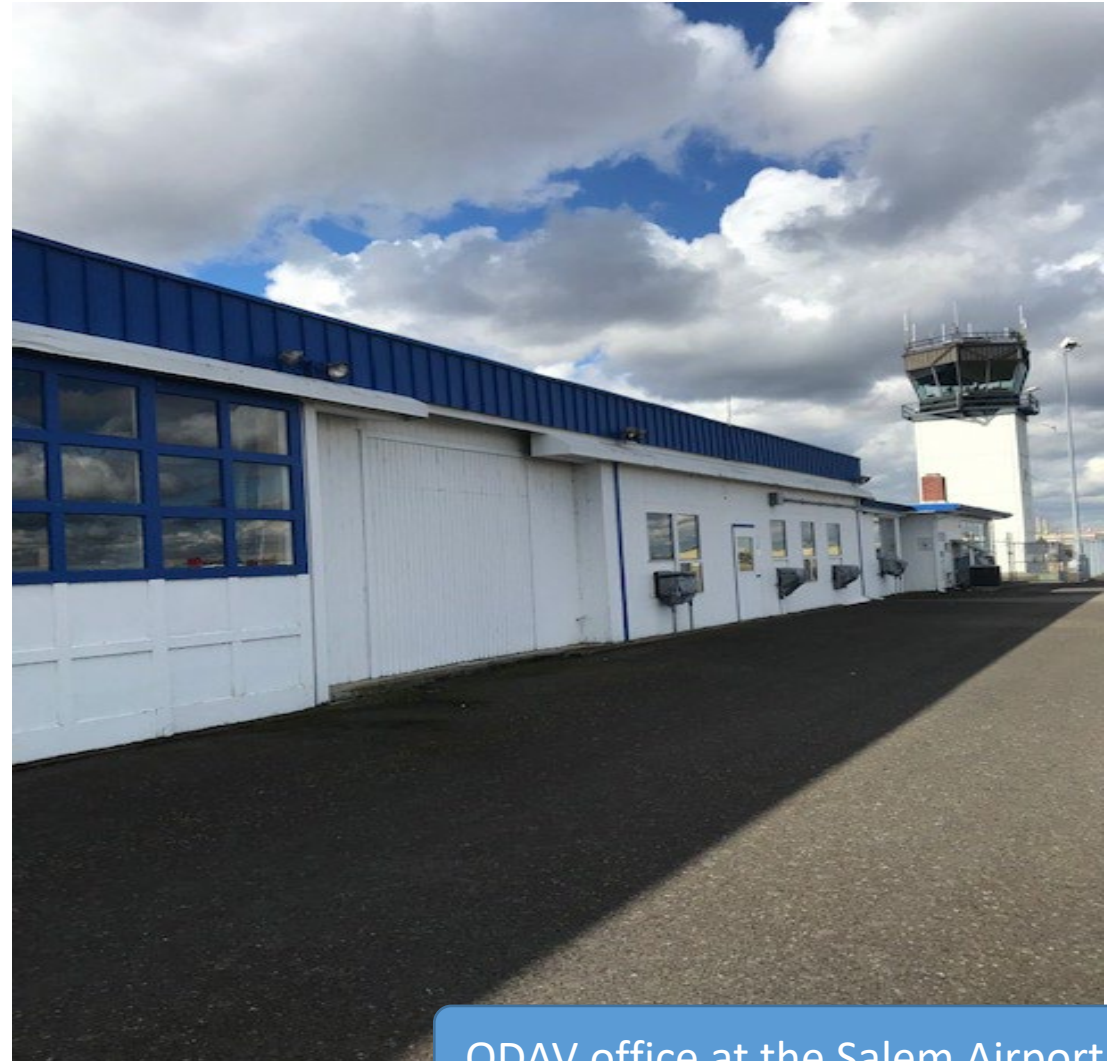
ODAV office at the Salem Airport