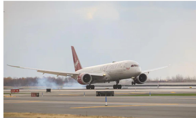
A Virgin Atlantic Boeing 787 arrives at John F. Kennedy International Airport, completing the first transatlantic flight powered by 100% sustainable aviation fuel.