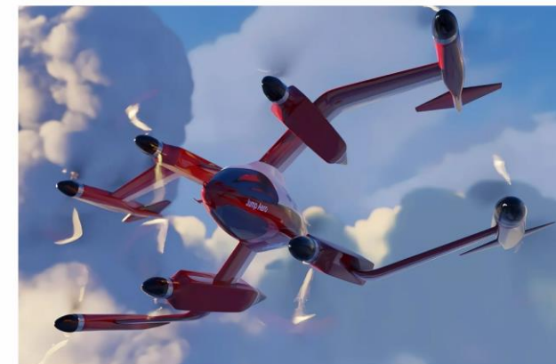
A digital rendering depicts what Jump Aero's JA1 Pulse eVTOL might look like in forward flight.