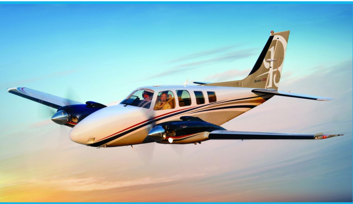
Critical Aircraft Beechcraft Baron

The Critical Aircraft is the most demanding type aircraft type, or grouping of aircraft with similar characteristics, that make regular use of the airport. The critical aircraft selected for Independence State Airport is the Beechcraft Baron 68 , a light, twin-engine, piston airplane. The characteristics of the Beech Baron determine the Runway Design Code as B-I (small) . This code establishes the design requirements for the airport to serve aircraft with approach speeds up to 120 knots, and wingspans up to 78 feet. The “small” designation refers to aircraft weighing less than 12,500 pounds.