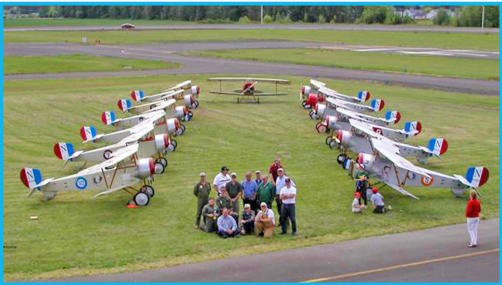
Experimental Aircraft Association 292

AAWS to be sited on west-side. Additional improvements are described in the Airport Master Plan Update.