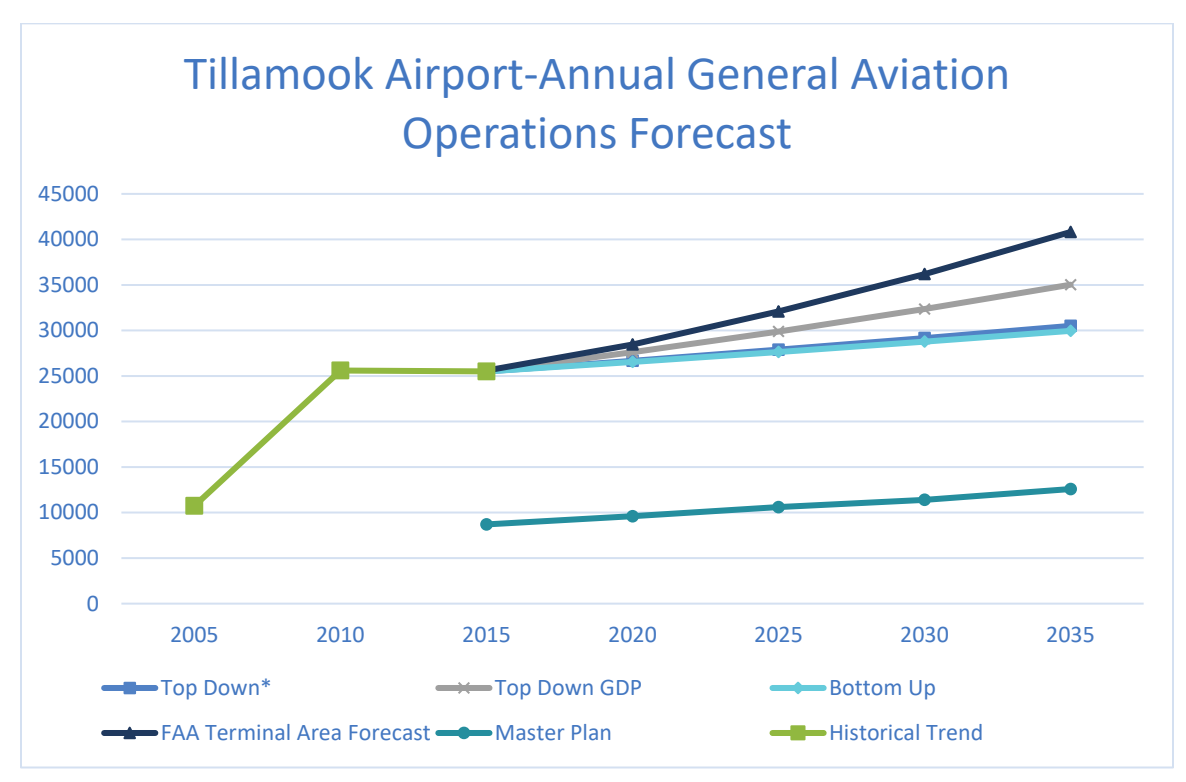
Source: FAA TAF, Jviation analysis, TMK airport master plan, * indicates preferred growth rate