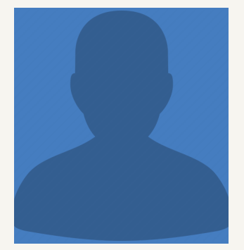
HILDA PEREYO Yamhill, OR

OUR S TATE OFFERS 97 AIRPORTS RANGING IN SIZE FROM LARGE COMMERCIAL SERVICE FACILITIES TO SMALL RURAL AIRSTRIPS. THESE AIRPORTS ARE VITAL TO OREGON'S ECONOMIC DEVELOPMENT AND PROVIDE SAFE AND EFFICIENT ACCESS TO THE STATE'S COMMUNITIES, RECREATIONAL AREAS AND ITS ABUNDANT NATURAL RESOURCES.