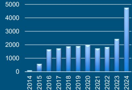
EDIS by Year

83% Adults on supervision with no new misdemeanor or felony convictions