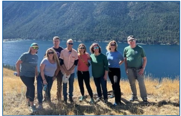
Board members visit Wallowa County in September 2024.

ORS 184.423 directs agencies to enable and encourage sustainable communities to achieve resilient local economies thriving work forces, efficient infrastructure investments, affordable housing, healthy watersheds and clean water – including communities that are economically distressed. The OSB supports these efforts by regularly meeting in, and engaging with, communities across Oregon.