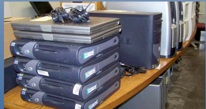
CPUs ready for refurbishing