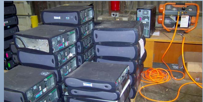
Property in storage

Garten sets apart reusable e-waste for refurbishing, then moves hard drives and other data storage devices to a secure location pending sanitization.