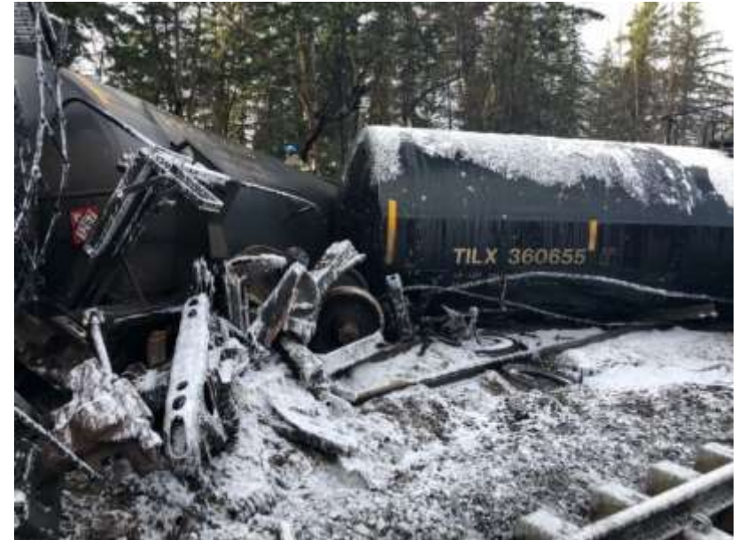
Custer Derailment – December 22, 2020

10 mid-train cars derail at 7.2 mph 2 cars breached and catch fire