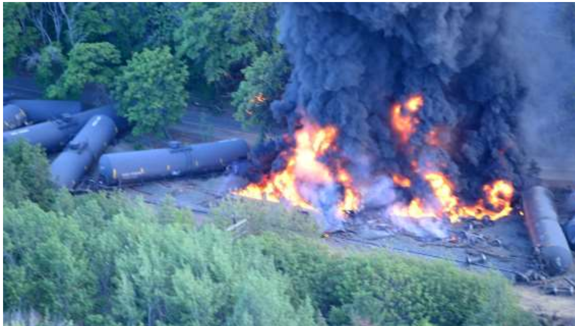
Mosier Derailment 2016

Addressing Contingency Plan requirements for High Hazard Rail through Oregon and implementing existing statute into OAR.