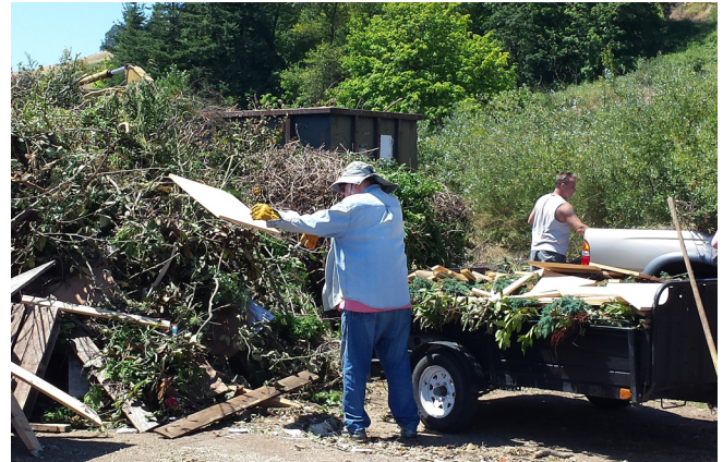
Above: Customers unload yard debris in Public Area.

Pacific Region Compost, the former drop-off site for yard debris and wood waste, is now closed to the public. In order to provide a safe location to dispose of organic material and purchase finished compost, during the ongoing construction projects that will improve the facility, the drop off and pickup area was moved to Coffin Butte Landfill.