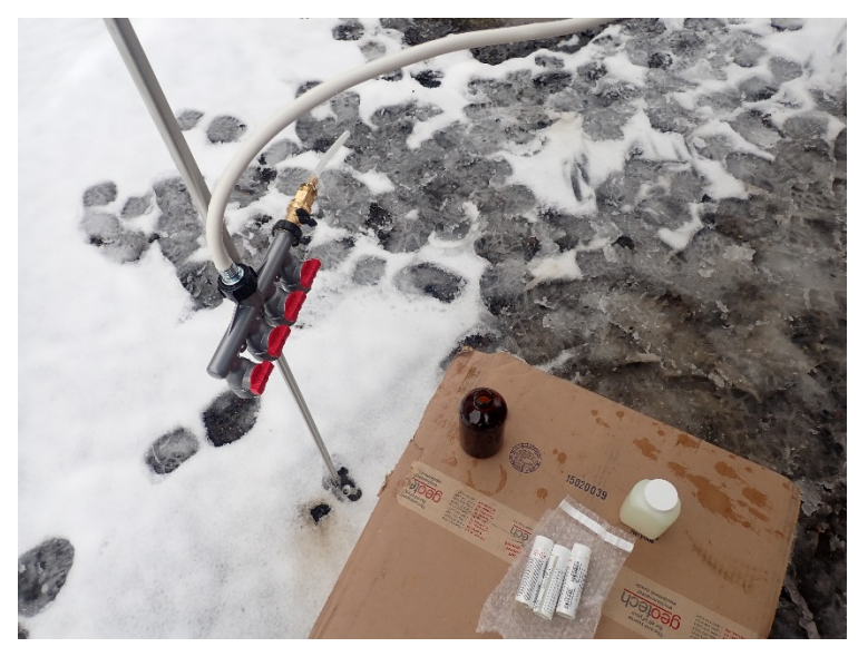
View of sampling manifold and hose connected to the spigot on the wellhead during sampling.