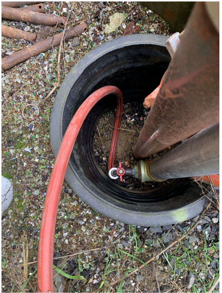
A garden spigot connected to the well head inside the well monument provided access for sampling. Note: the pictured hose was not utilized for sampling collection.