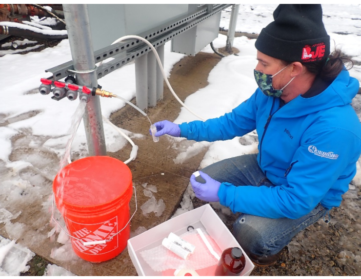
View of ground water being sampled from a barbed fitting on the sample manifold.