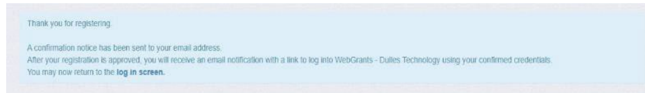
Figure 4. Registration request confirmation

When complete, click Save Registration Information at the top or bottom of the page. You will receive a confirmation of your registration with the message that an alert notification has been sent to your email address and an email alert. See below examples of alert notifications.