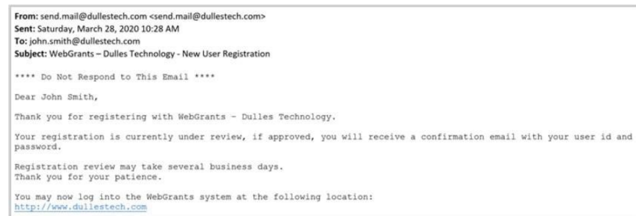
Figure 5. Email alert of your registration being received

Note: Your registration will be approved manually by DEQ's grants coordinator, please allow one to two business days.