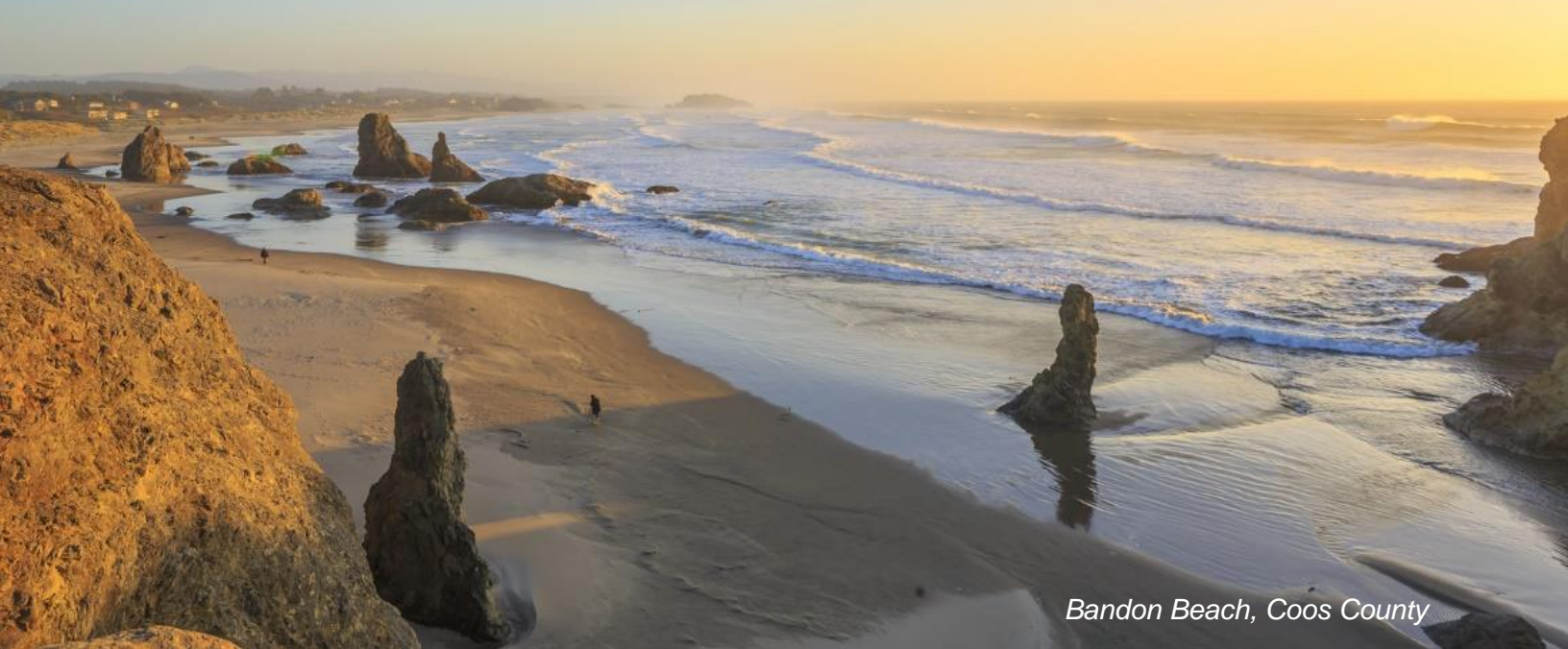
Bandon Beach, Coos County