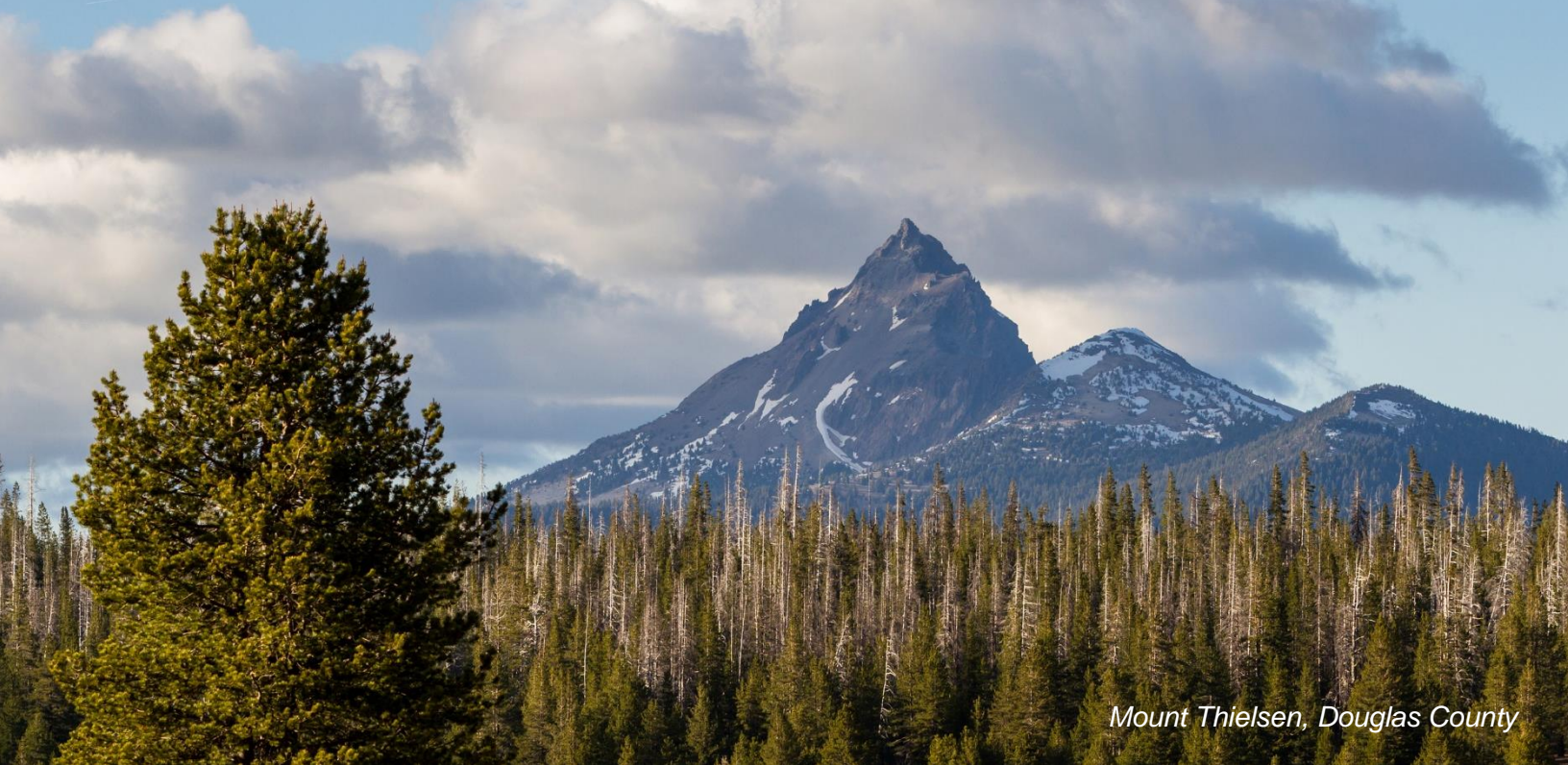
Mount Thielsen, Douglas County

significant risks to agricultural production. Meanwhile, rising sea levels threaten coastal communities. 3