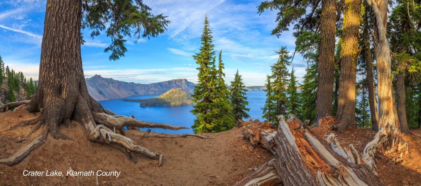
Crater Lake, Klamath County