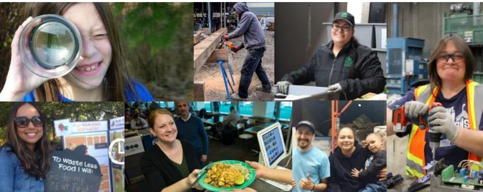
Materials Management Grant recipients (clockwise) Oregon Green Schools, Salvage Works, Marion Polk Food Share, Corvallis Sustainability Coalition, Port of Portland, Community Warehouse and Free Geek

Grants matter because people and organizations need money to do this work, and our grant funding is often the one of the few sources of available for this type of work in Oregon. We cannot achieve the 2050 Vision without the contributions and creativity of local communities. Grants expand our reach by connecting with local governments, nonprofits, schools and Tribal governments. Examples of funding projects include those that reduce food waste in school cafeterias, support recycling infrastructure in rural communities and encourage reuse and repair of household items.