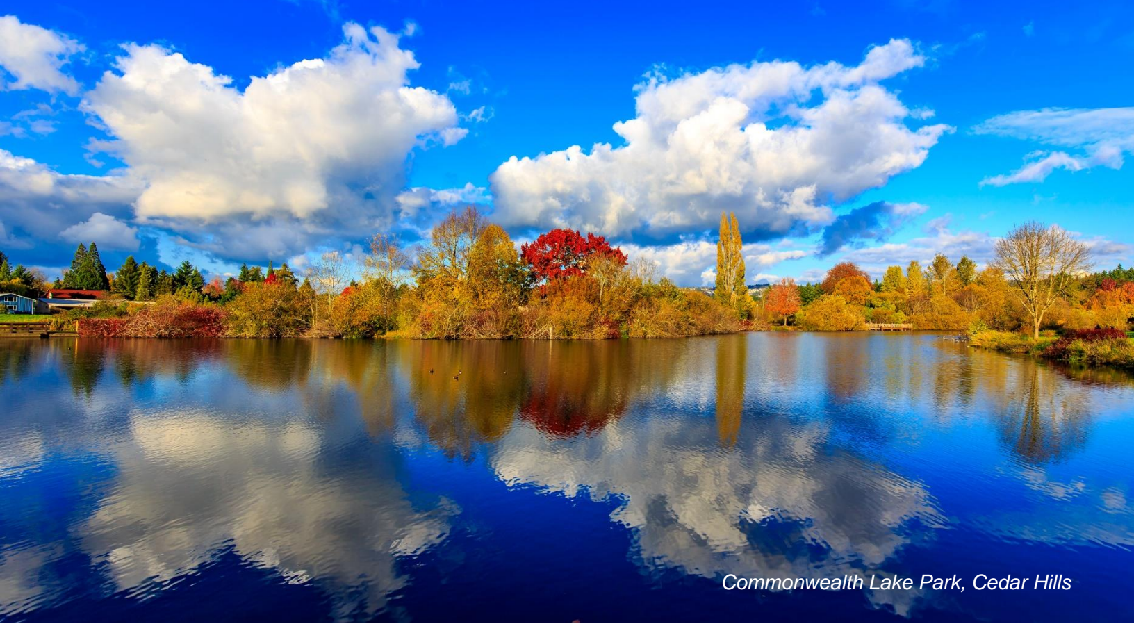
Commonwealth Lake Park, Cedar Hills