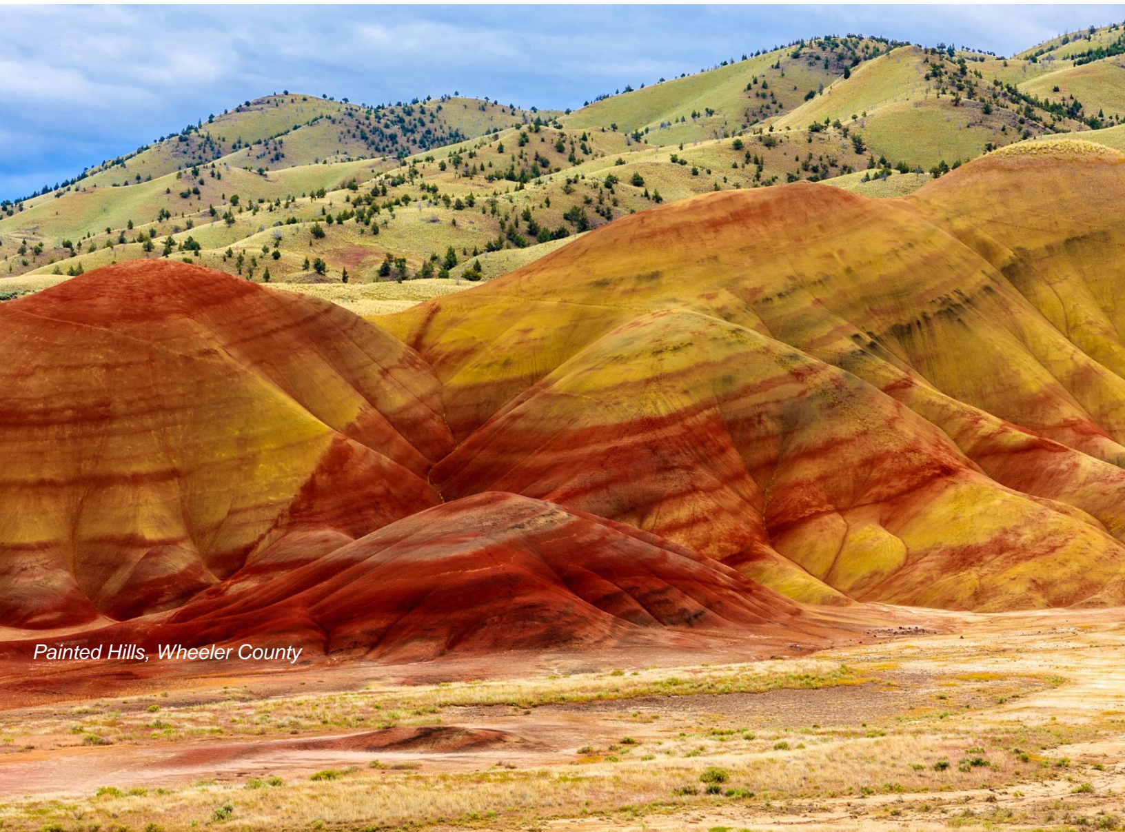
Painted Hills, Wheeler County

State of Oregon Department of Environmental Quality