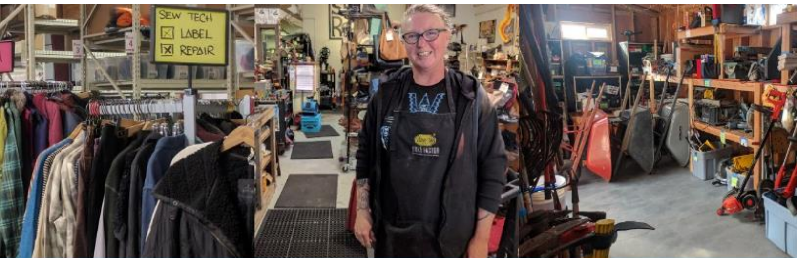
DEQ reuse and repair grant recipients (left to right): Renewal Workshop, JD's Shoe Repair and ToolBox Project

DEQ has an existing Strategic Plan for Reuse, Repair and Extending the Lifespan of Products in Oregon that covers the period of 2016-2021. The plan identifies three priority materials: building materials, textiles, and manufactured goods that have remanufacturing potential. The plan also identifies a number of specific strategic actions, including foundational research, expanding infrastructure, increasing demand, and providing policy support where needed. Examples include grants to support workforce development and industry expansion, new infrastructure and reuse opportunities. Additional actions include partnerships with businesses to advance "circular" models that prioritize reuse, repair and remanufacturing; and support for state and local incentives like deconstruction and adaptive reuse of buildings, Right to Repair legislation, and single-use product restrictions.