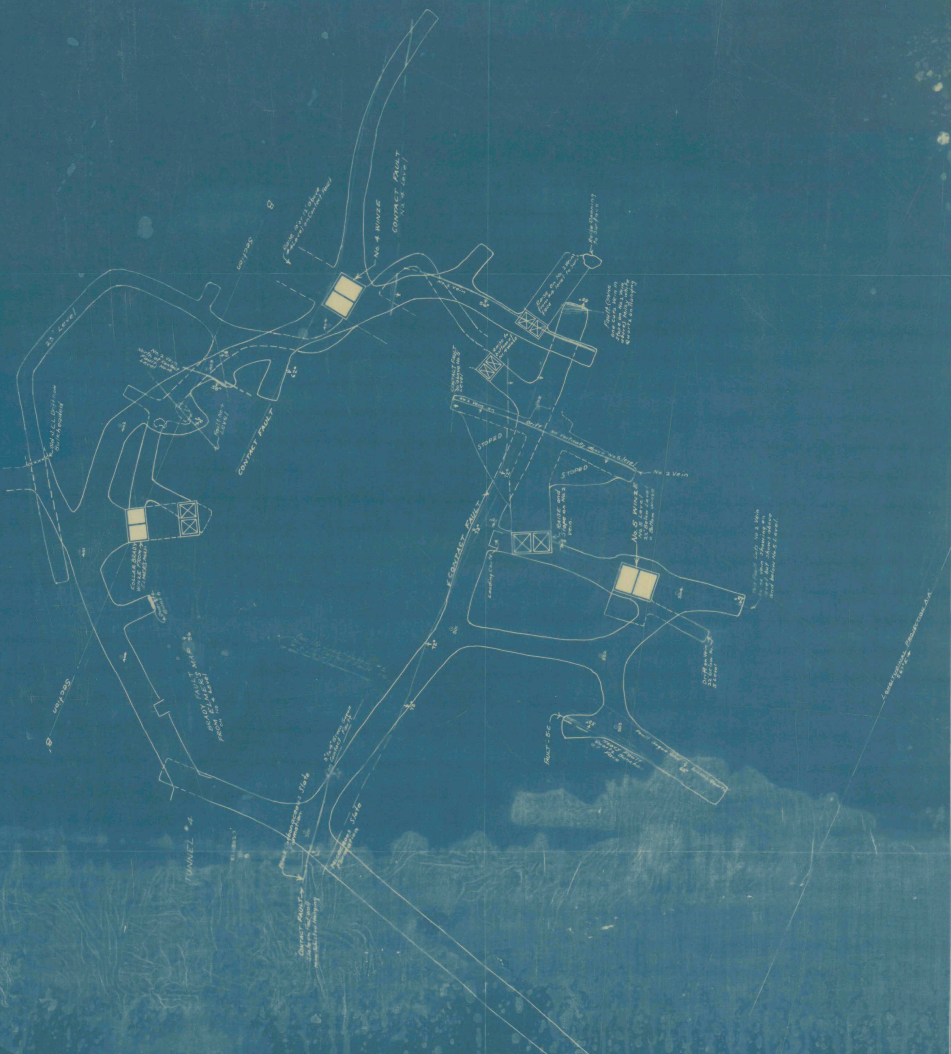
PLAN MAP J.C.L. MINE SHOWING TUNNEL LEVELS AND WORKINGS ON NO. 2 VEIN - ALSO MAJOR FAULTS AND GEOLOGY DEC 20, 1932 SAILEN VANDER