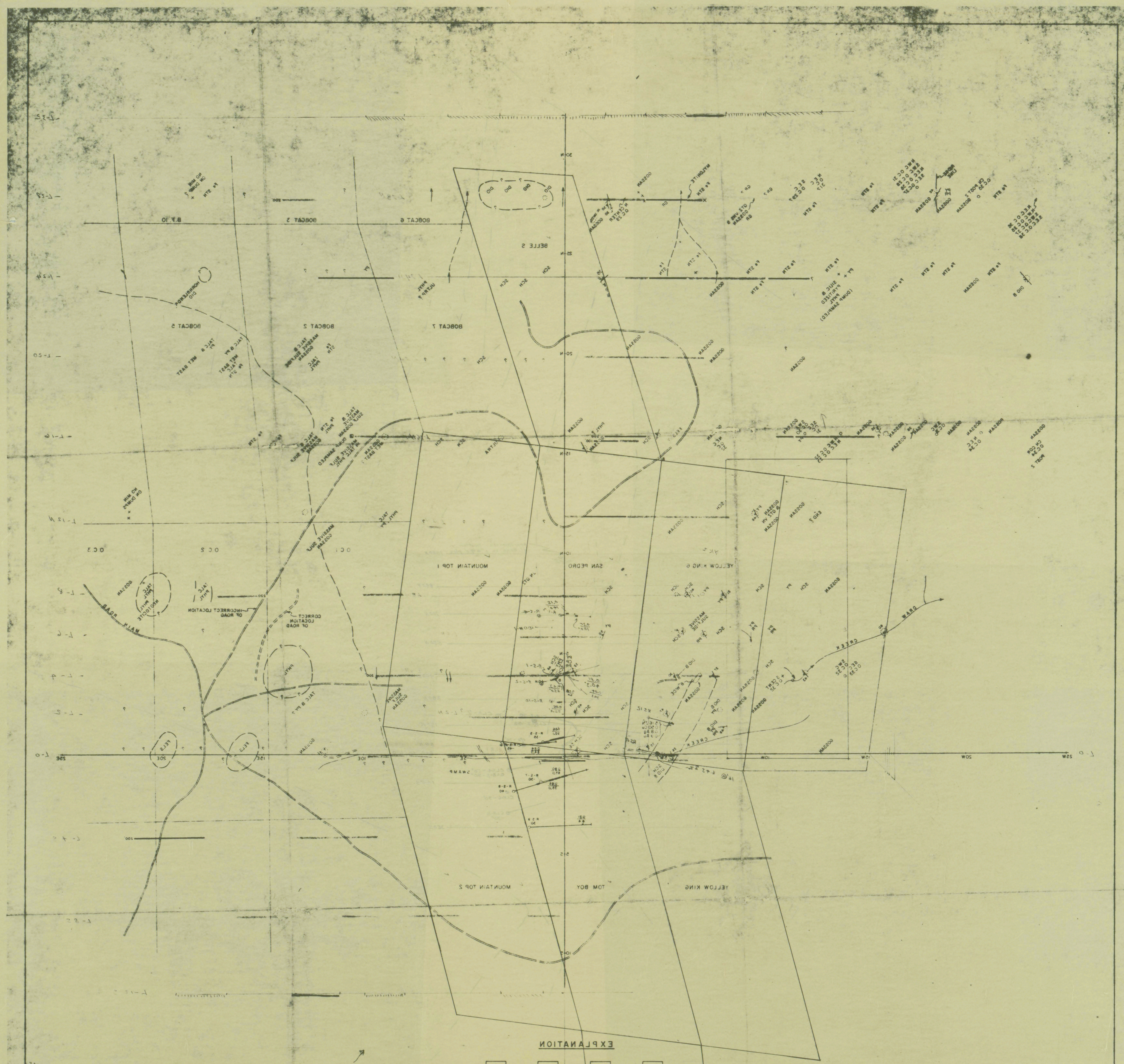
PLATE 2 UNION PACIFIC RAILROAD COMPANY NATURAL RESOURCES DIVISION-MINING SALT LAKE CITY, UTAH GEOLOGIC MAP-ROWLEY AREA ROWLEY-BANFIELD PROJECT DOUGLAS COUNTY, OREGON BY: D. G. FOR D. MANN DATE: MAY, 1928 TO ACCOMPANY:

LIBRARY OREGON DEPARTMENT OF GEOLOGY AND MINERAL INDUSTRIES SUITE 905 800 NE OREGON STREET PORTLAND, OREGON 97232 P-93